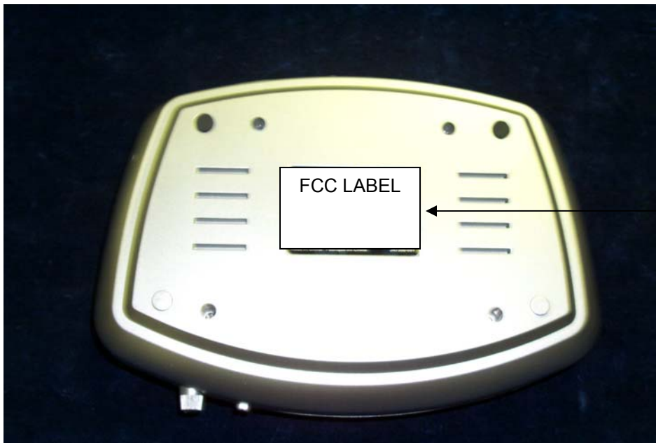
Figure 2.2 Location of the Label