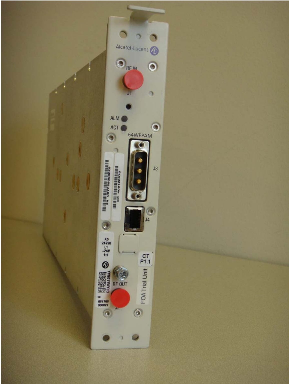
Photograph of Front