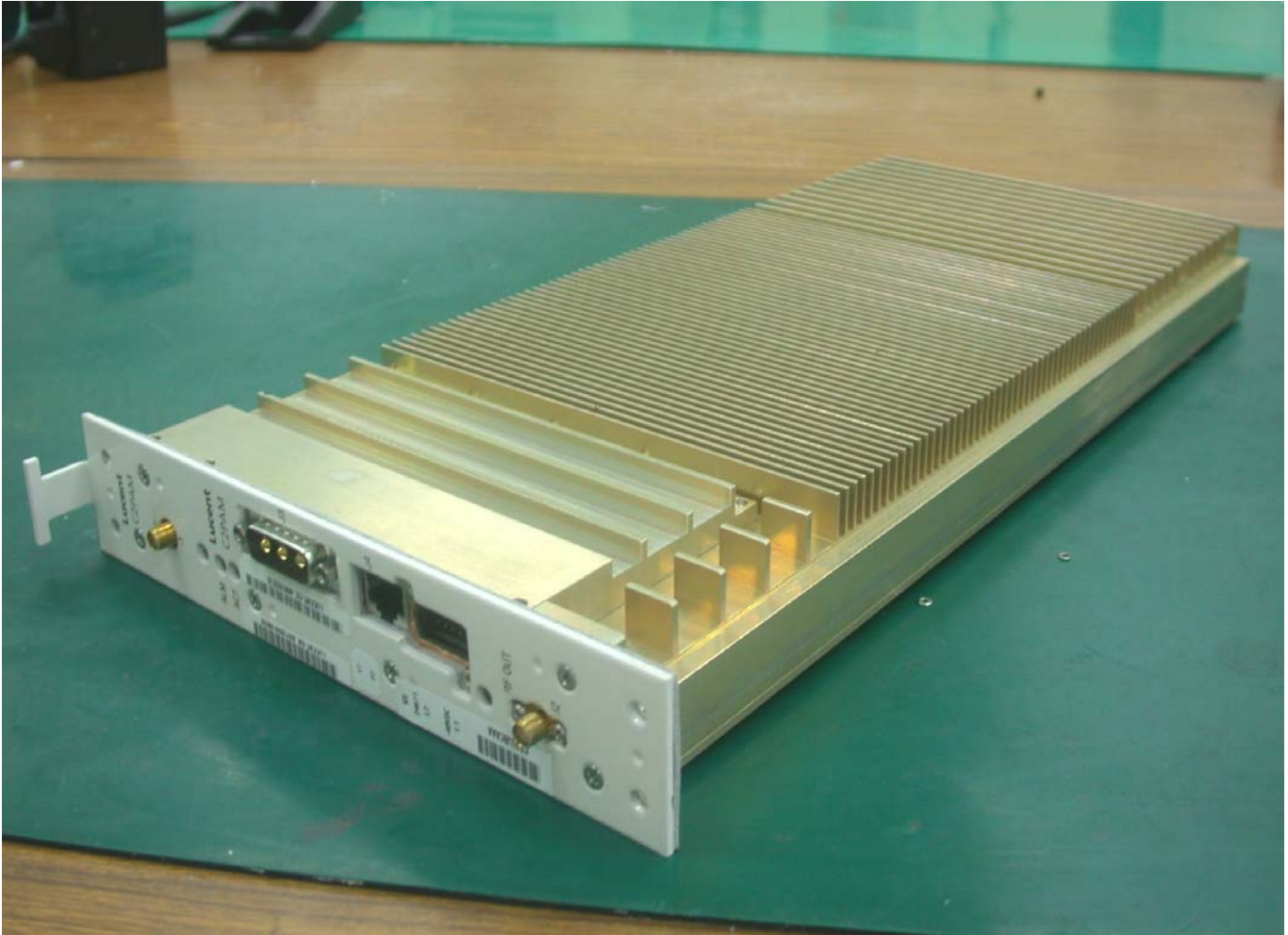
AS5ONEBTS-13 C2PAM Side View with Cooling Fins