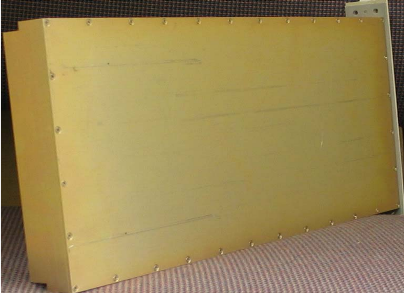
AS5ONEBTS-06 P2PAM Side View