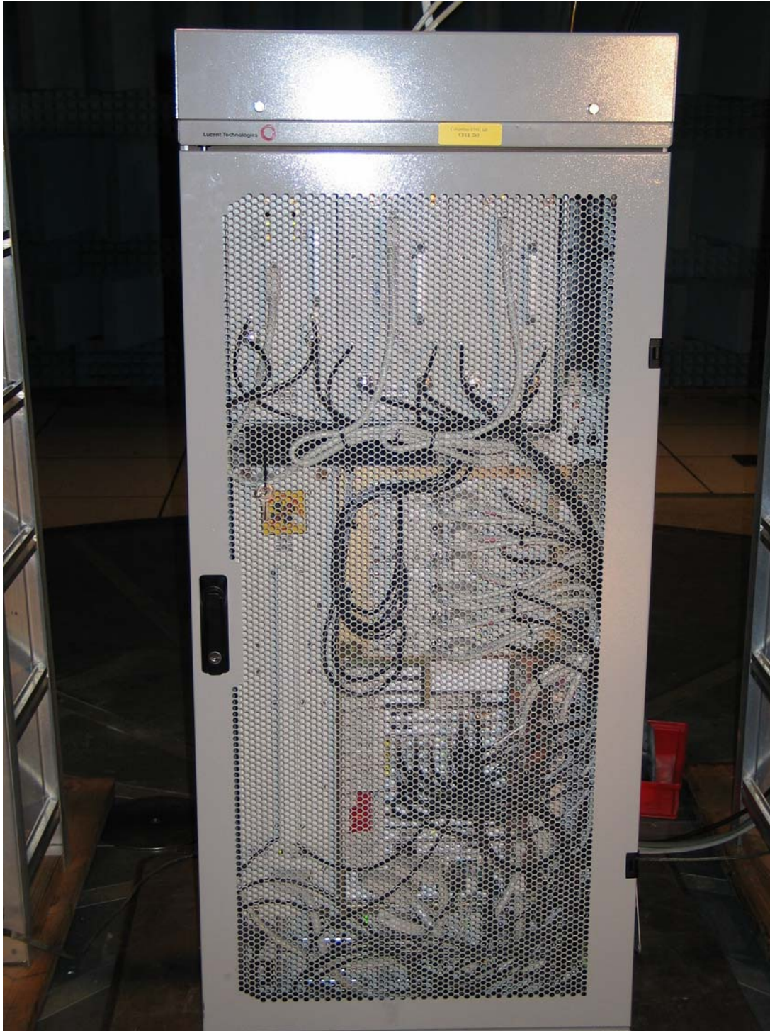
Alcatel-Lucent UMTS CDMA 850 Indoor Base Transceiver Station (BTS) Front View