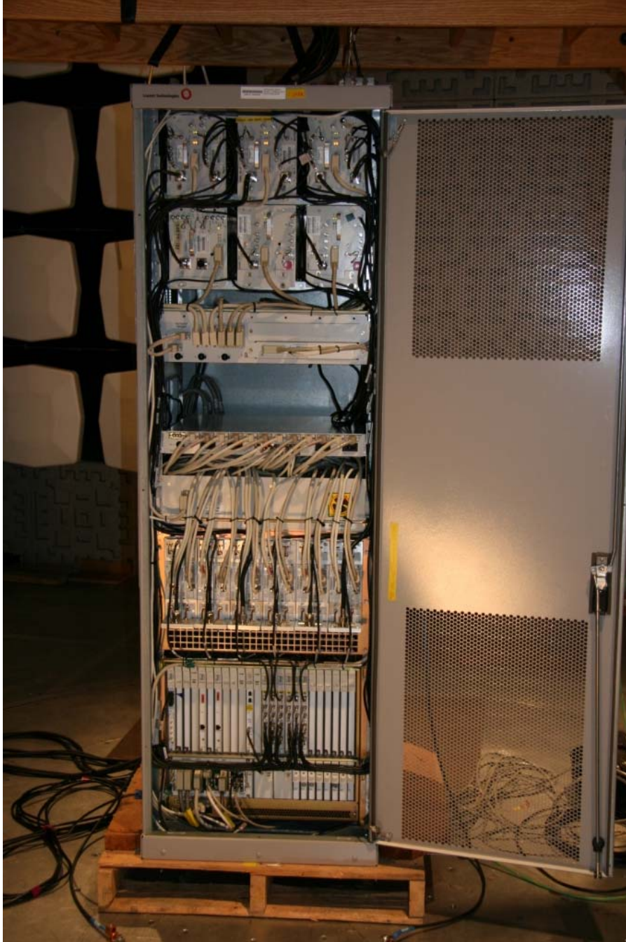
View: UMTS1900 Equipment Frame Front View with Door Removed