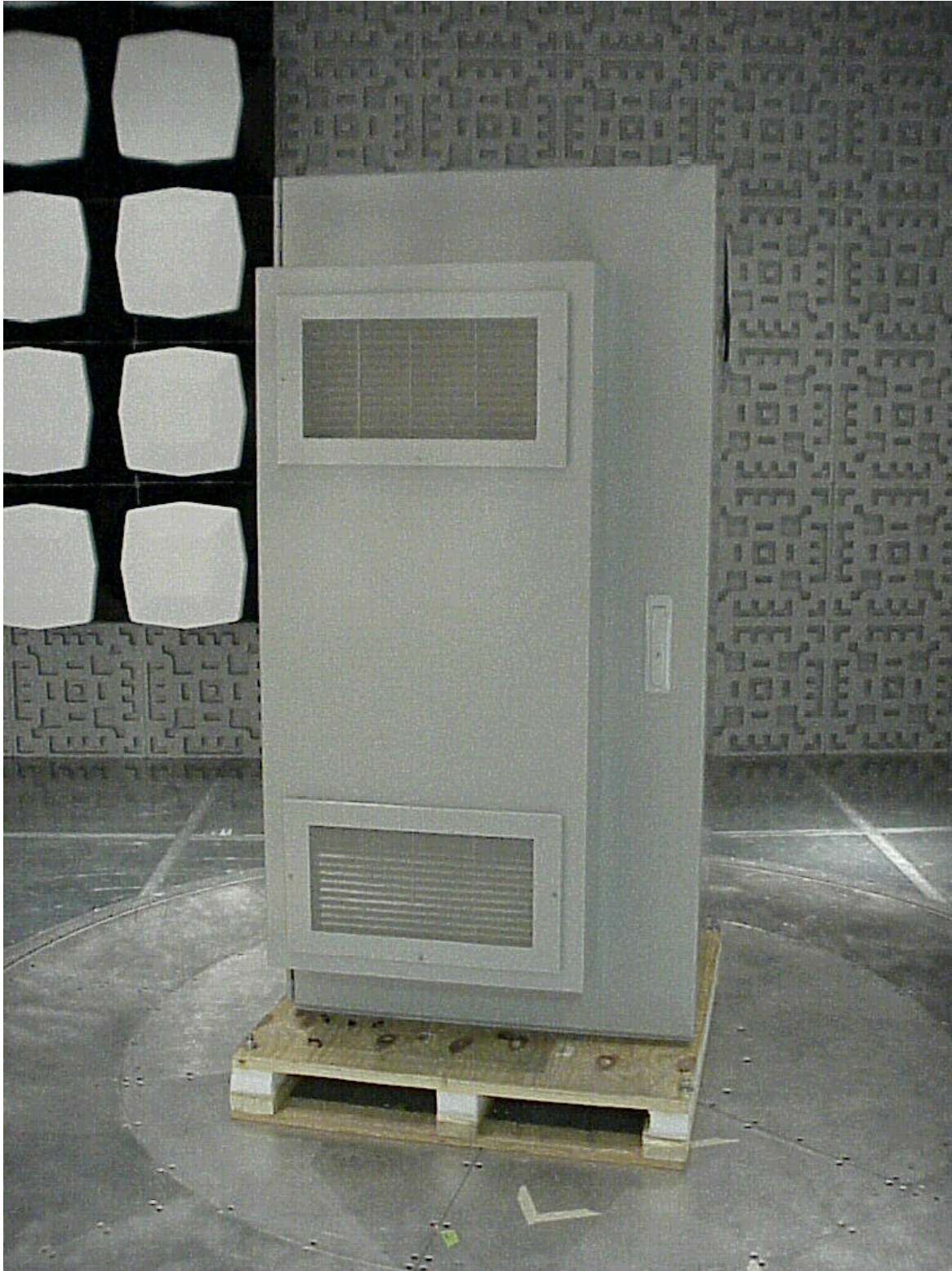
Exhibit 19: PCS Outdoor Flexent OneBTS Modular Cell 3.0 -- Front