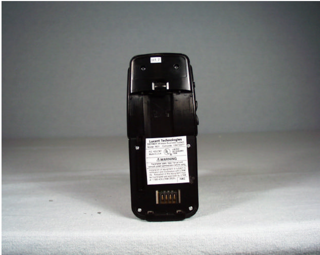
Photograph showing label placement