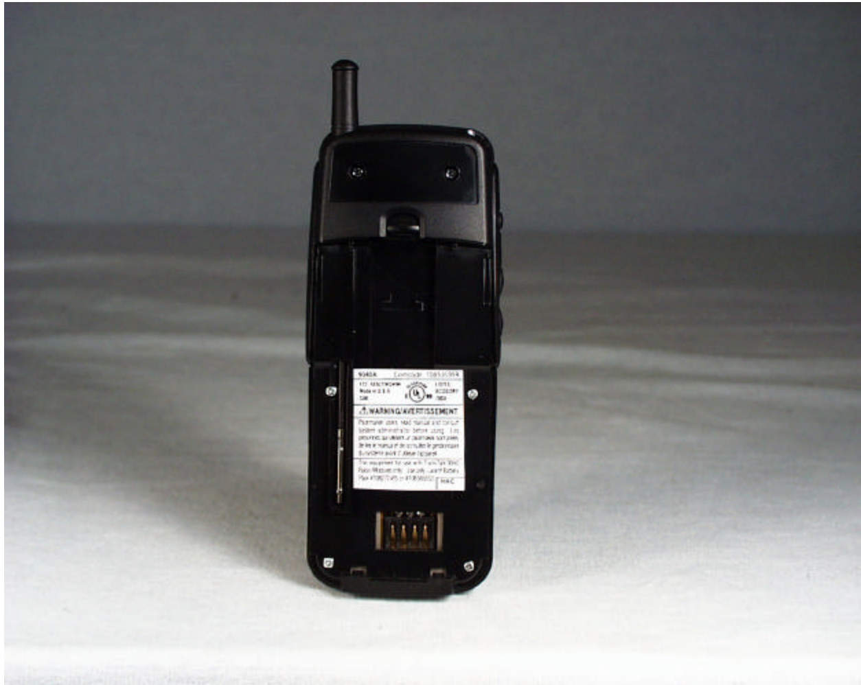
Photograph of the back exterior of the handset, showing the label placement.