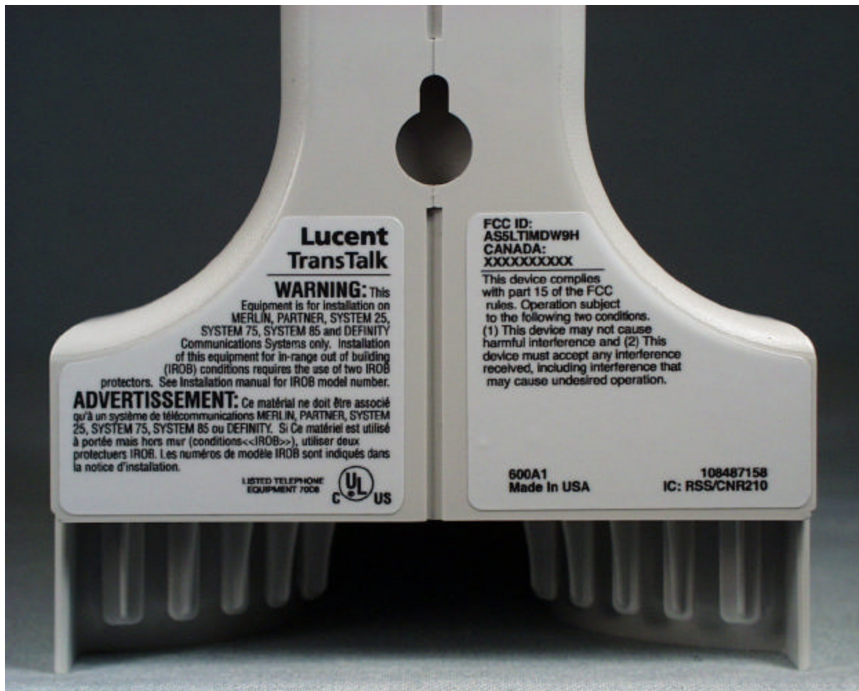
Photograph of label on the back exterior of the base.