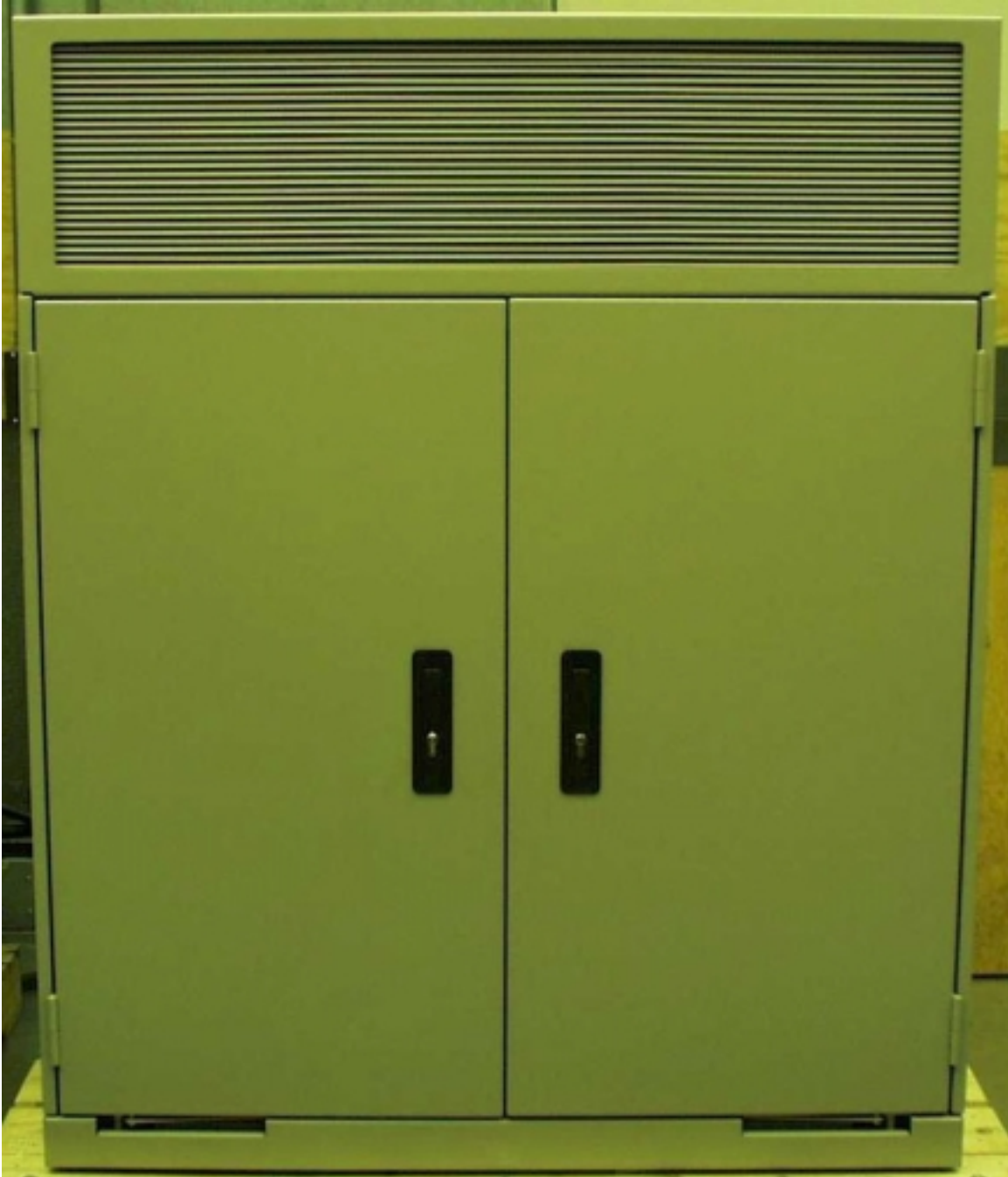
PHOTOGRAPH-1: FRONT VIEW OF OUT-DOOR MACROCELL