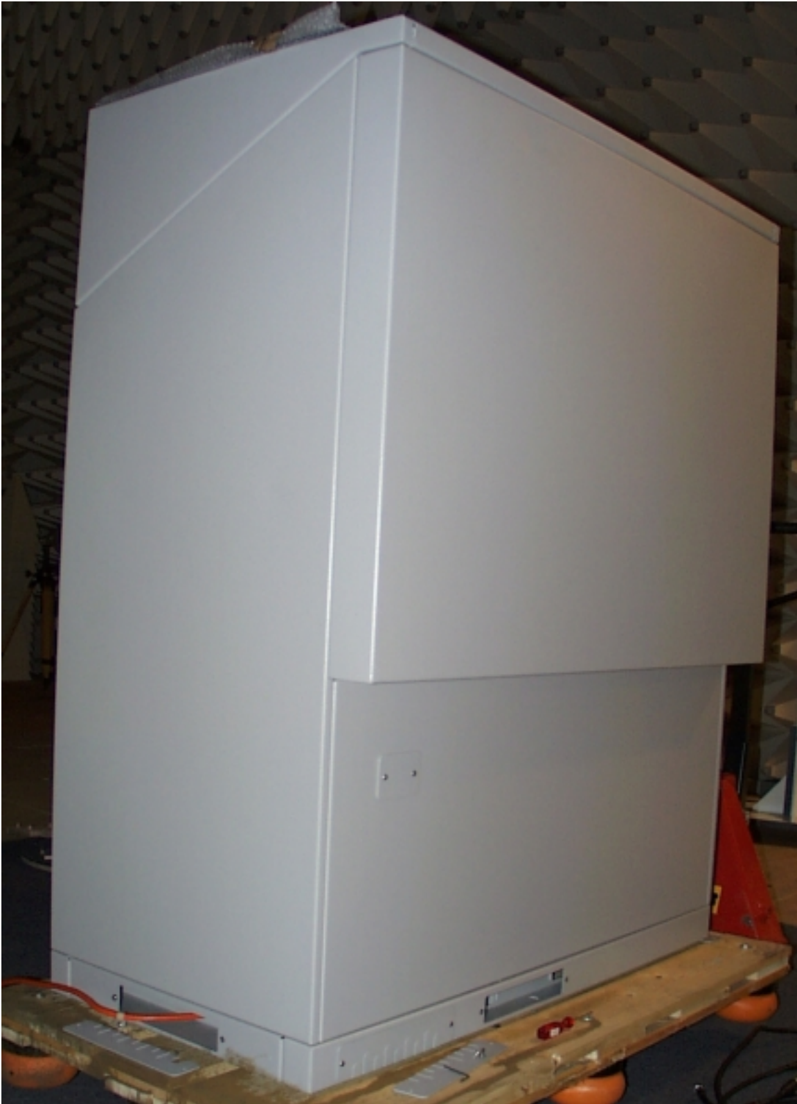
PHOTOGRAPH-3: REAR AND SIDE VIEWS OF OUT-DOOR MACROCELL