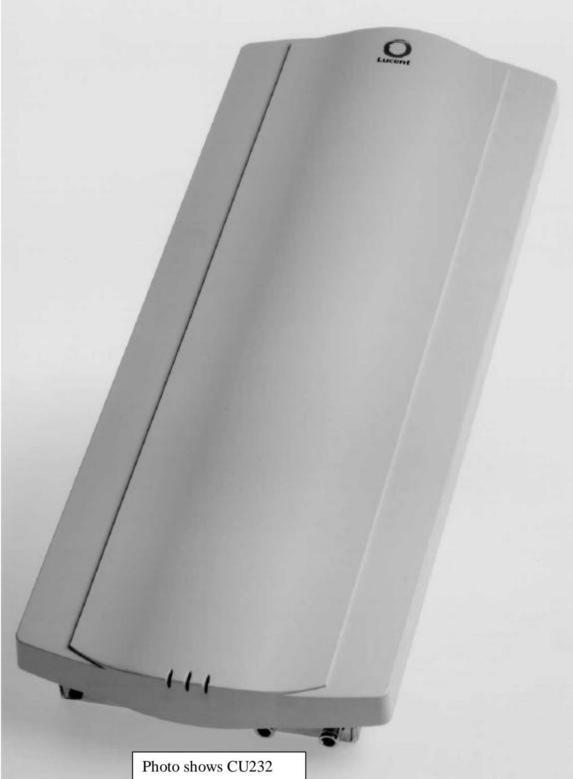
Photo shows CU232 front exterior.