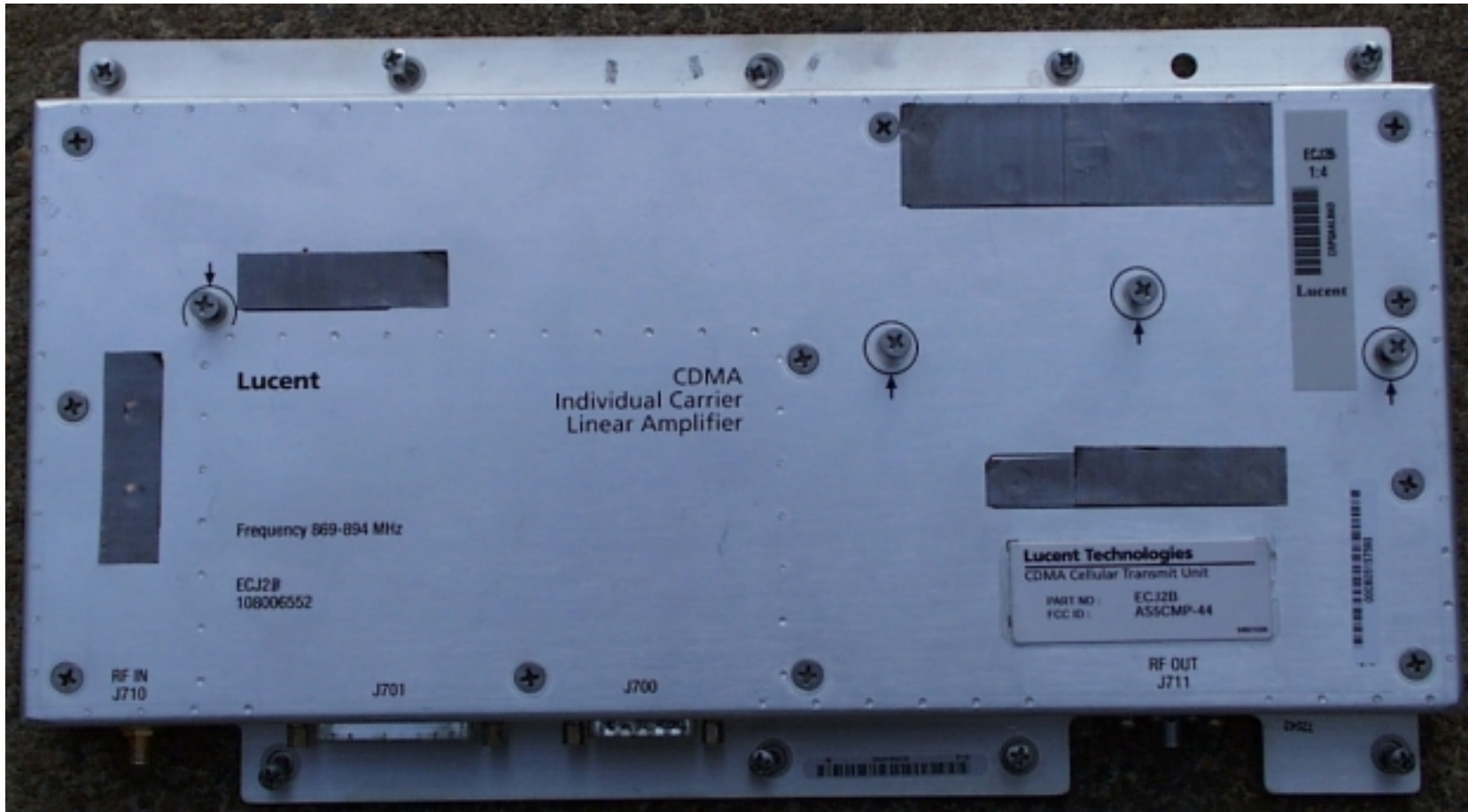
PHOTOGRAPH 2A : ICLA Showing FCC ID: AS5CMP-44 (Front)