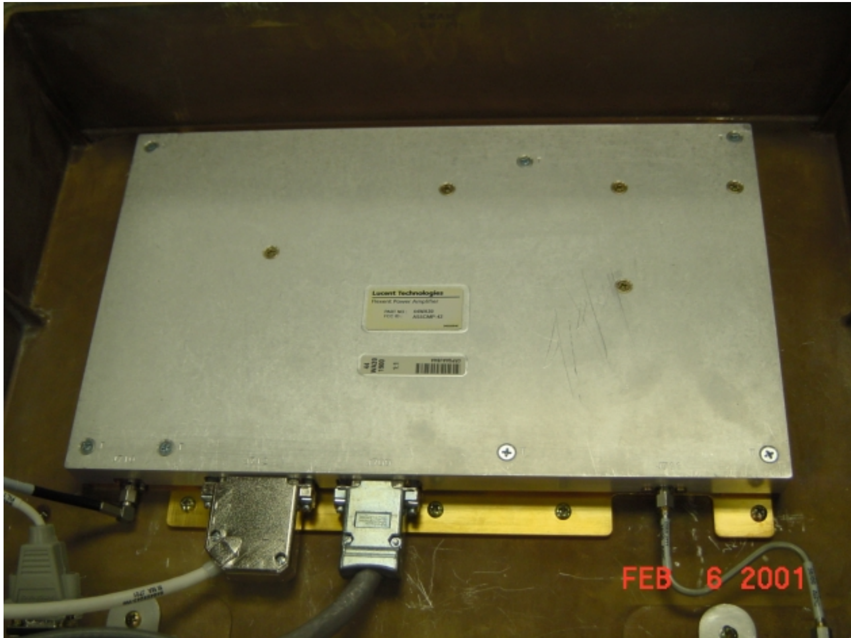
Photograph 1: PA Installed in a RFU cabinet