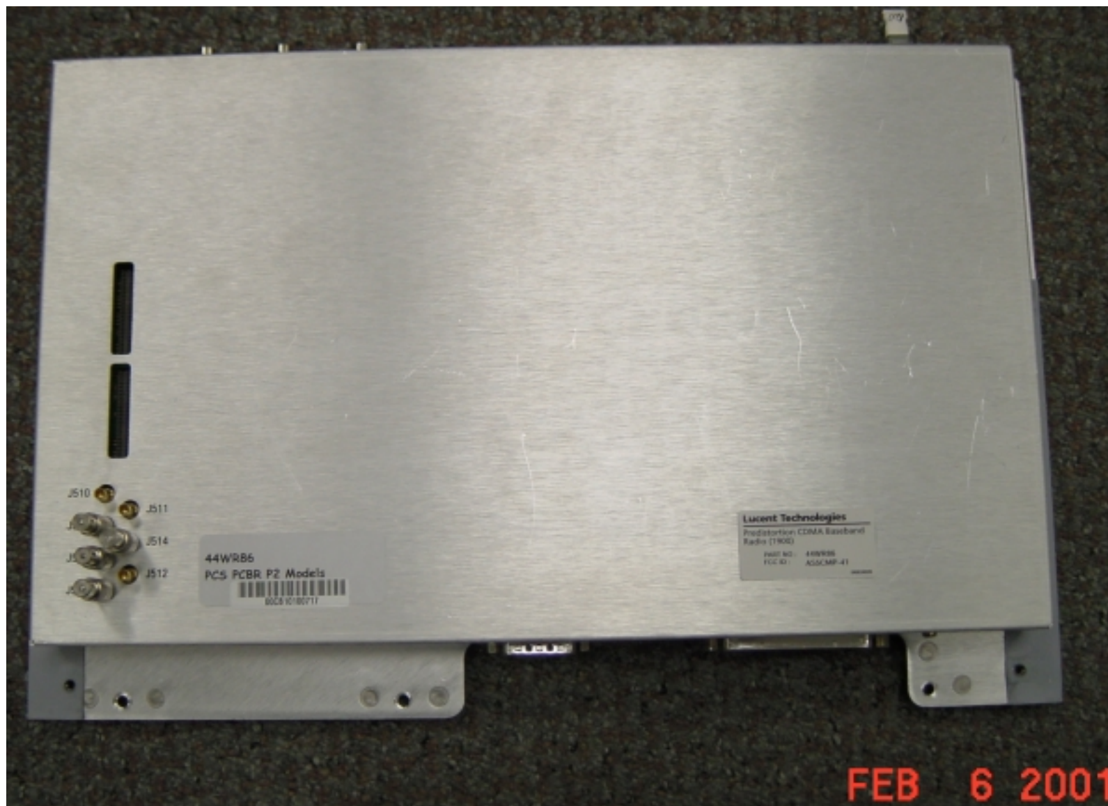
Photograph 2A: PCBR Showing FCC ID: AS5CMP-41 (Front)