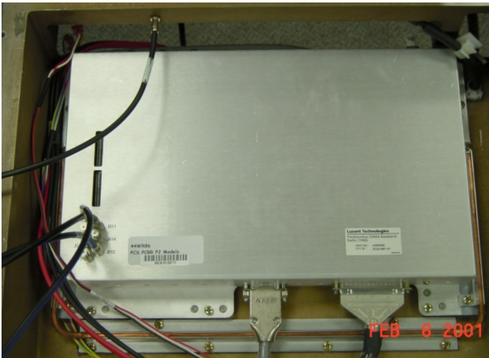
Photograph 1: PCBR Installed in RFU Cabinet