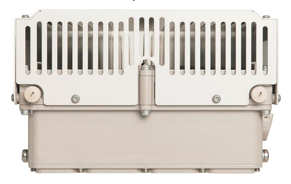
External Bottom View of the RRH