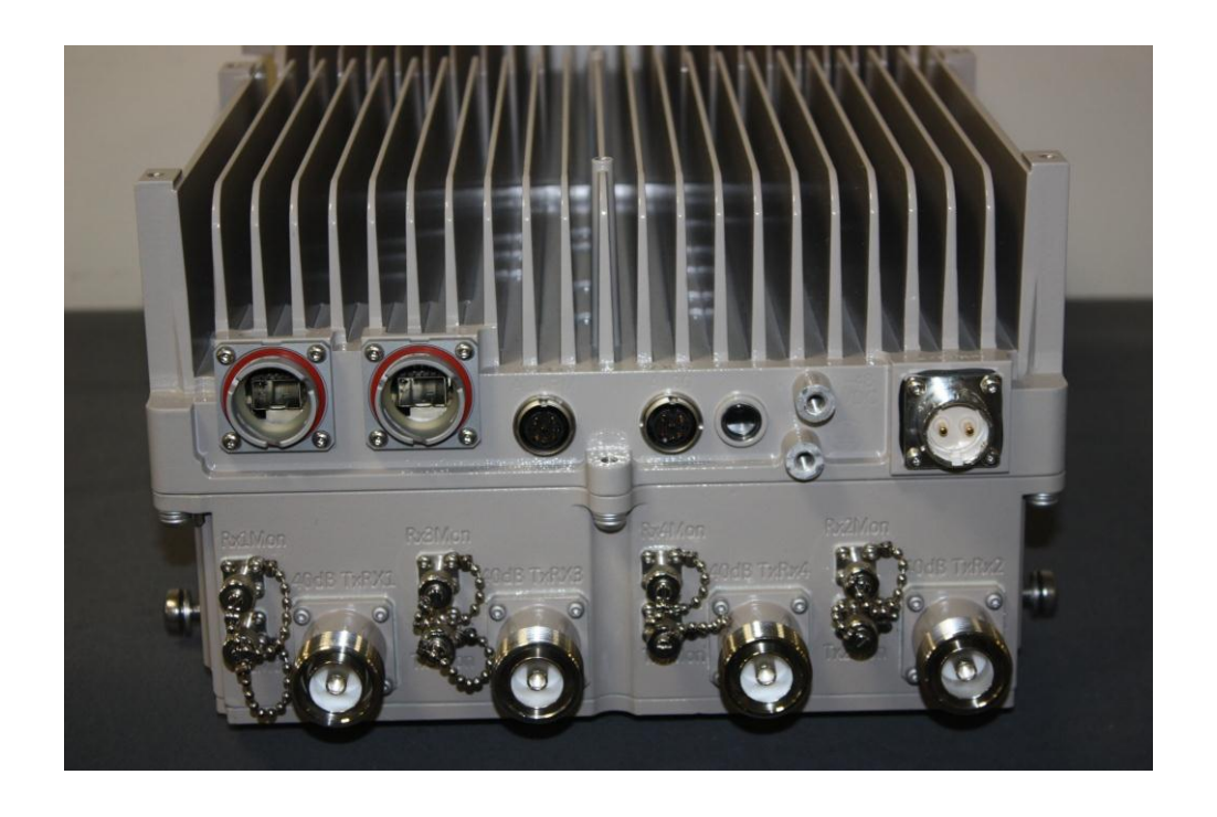
Page 4 of 6