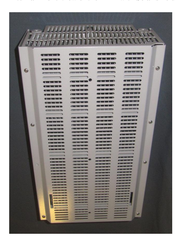
External Front View of the RRH without Solar shield