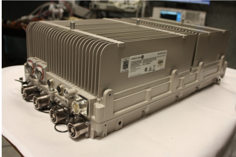
Front, Top, Left Side View