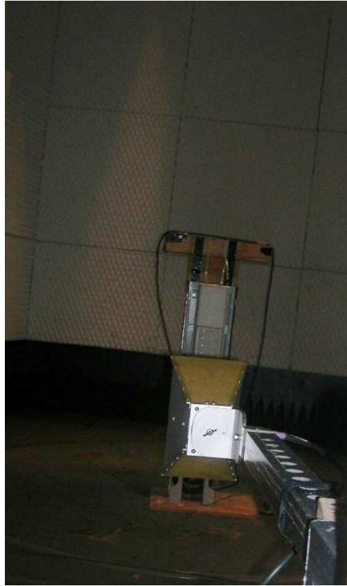
Figure 10.1 Setup Photo of Radiated Emissions Test