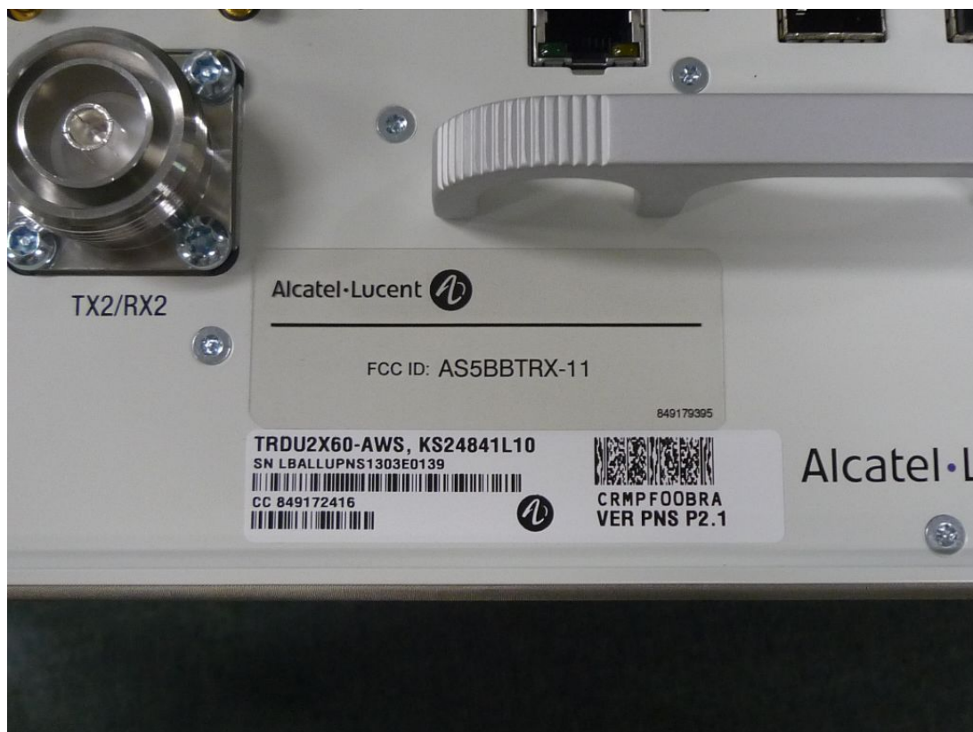
Photograph of FCC ID Label Affixed