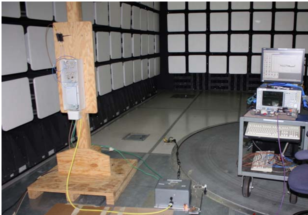
Figure 11.3 Setup Photo of Conducted Emissions Test at Power Ports.