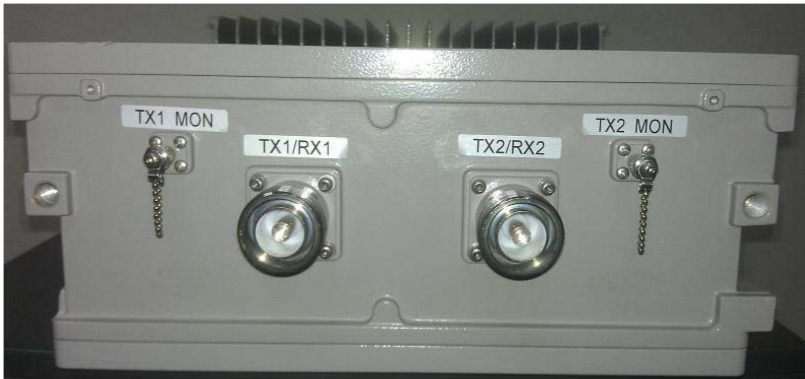
Figure 1 RRH2x40_07L-AT from top side, showing Tx/Rx antenna and Tx Monitor connections