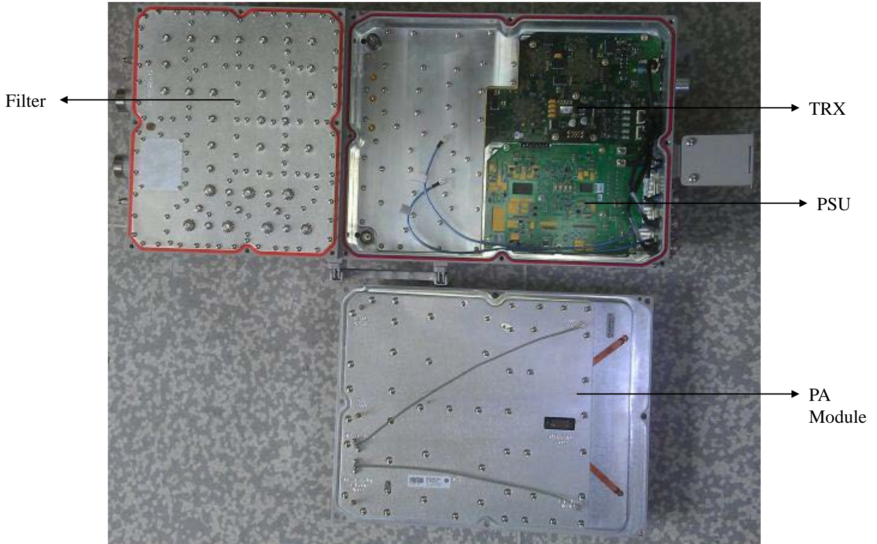
Figure 3 RRH2x40_07L-AT internal showing, full view