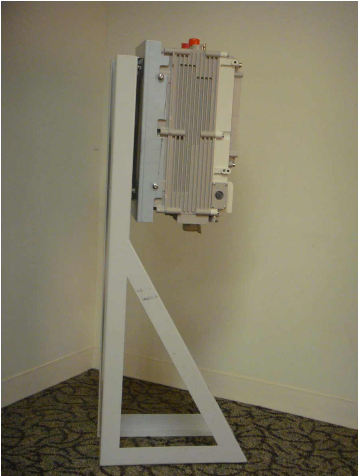
Photograph of left