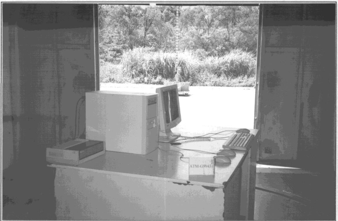
SETUP WITH MAXIMUM DETECTED EMISSION AT VERTICAL POLARIZATION