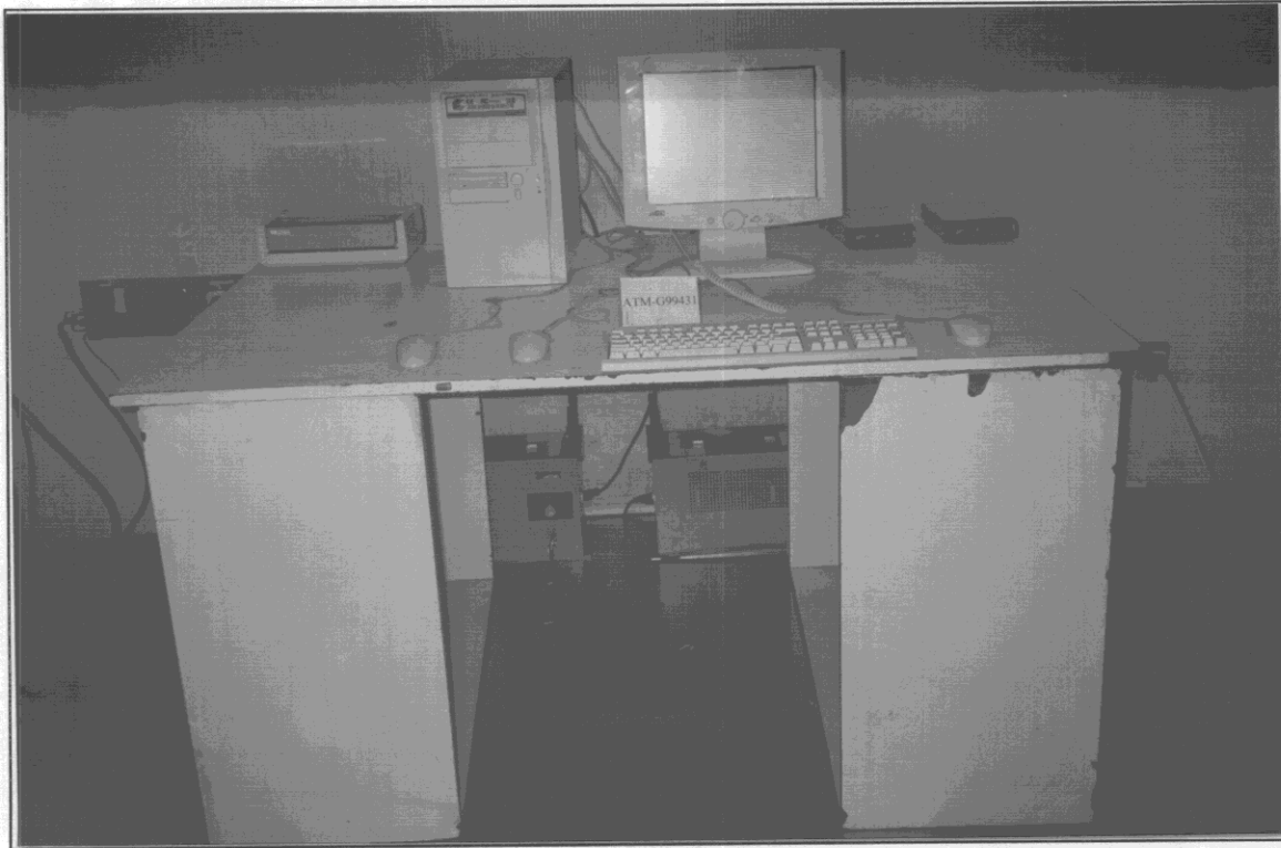
FRONT VIEW OF CONDUCTED TEST