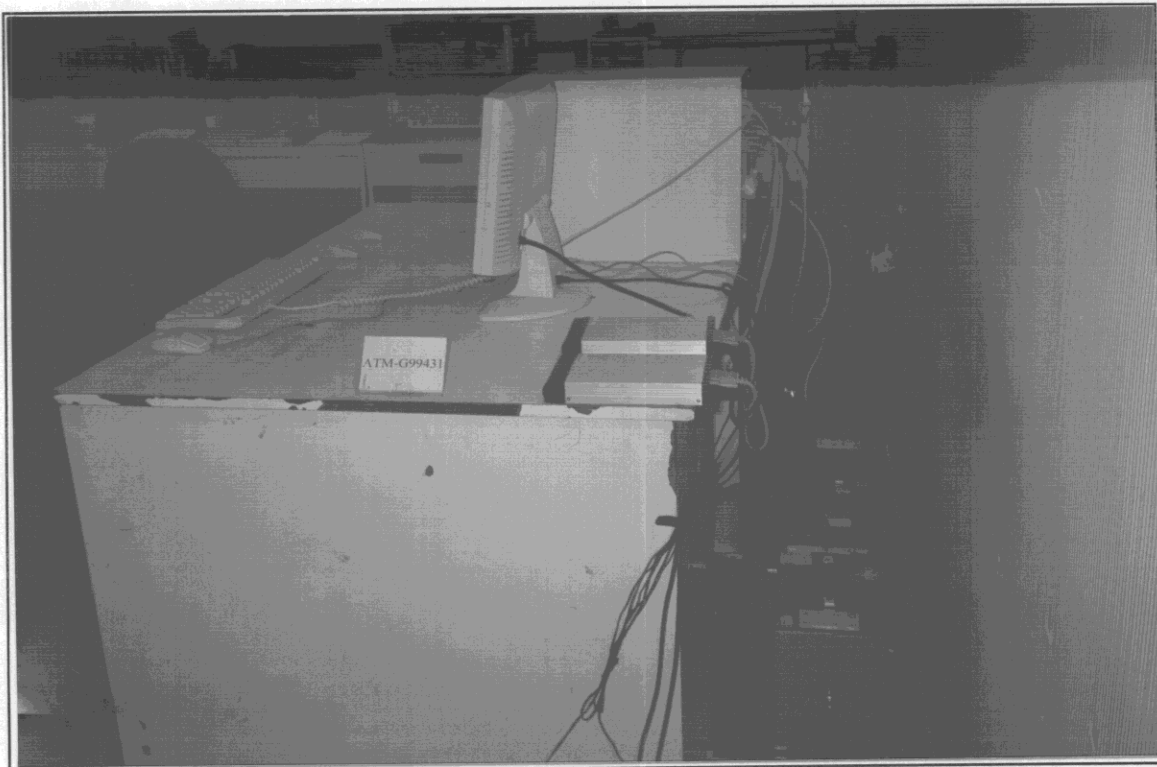
BACK VIEW OF CONDUCTED TEST