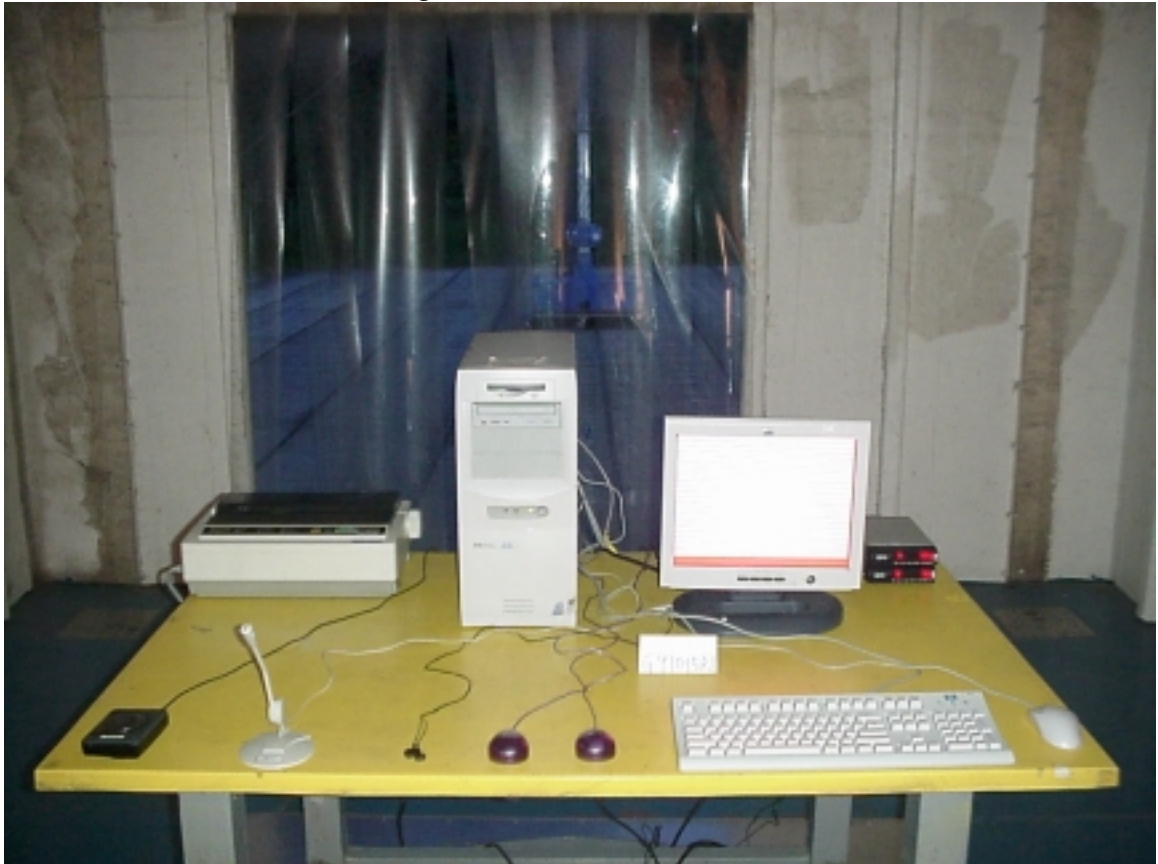
FRONT VIEW OF RADIATED TEST