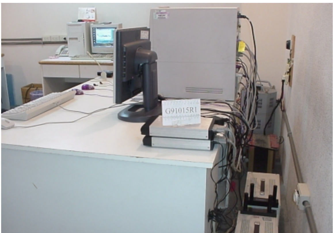
BACK VIEW OF CONDUCTED TEST