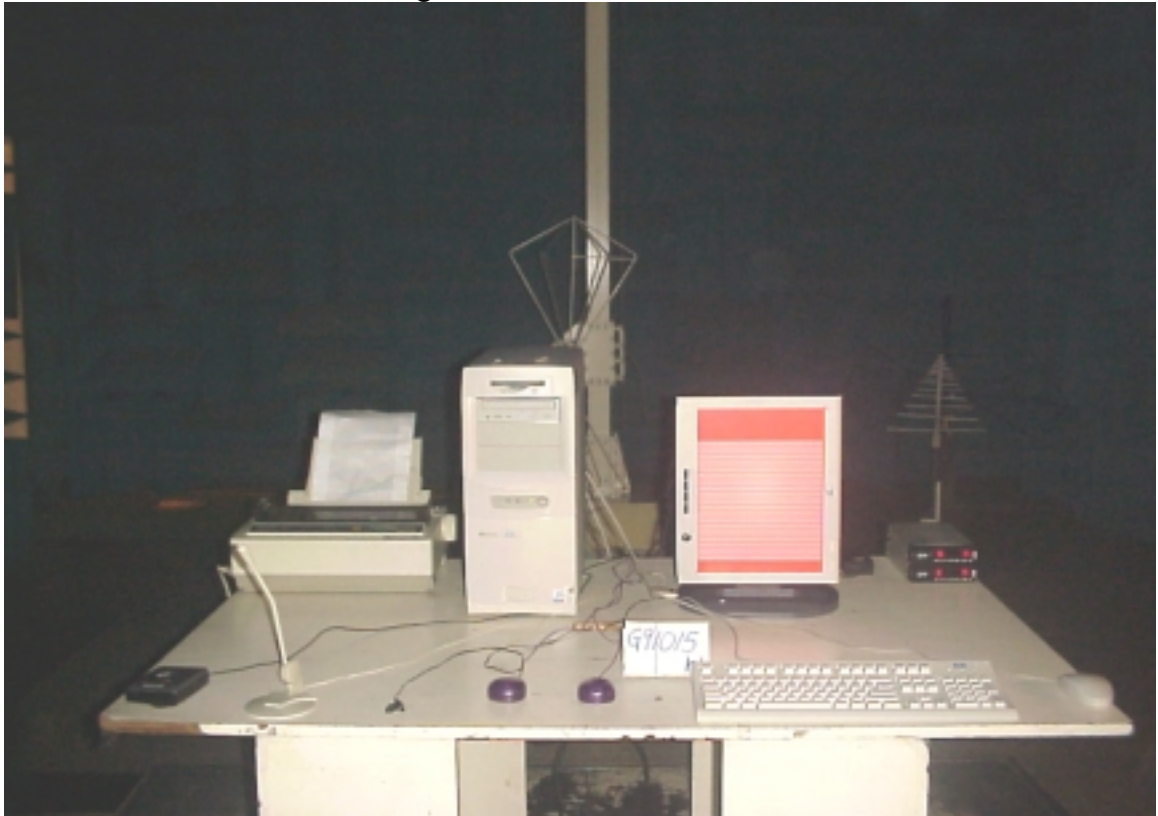
FRONT VIEW OF RADIATED TEST