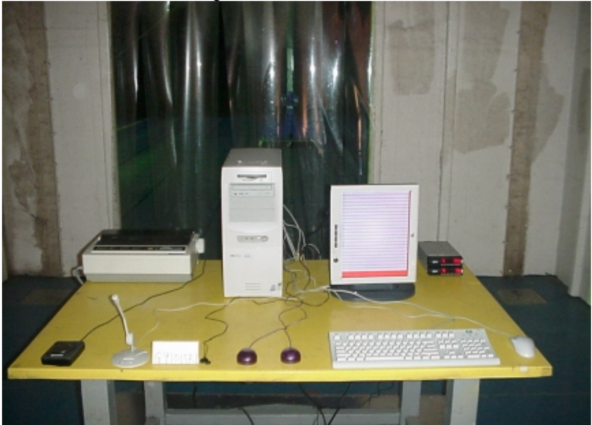
FRONT VIEW OF RADIATED TEST