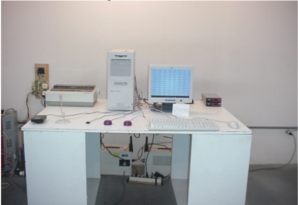
FRONT VIEW OF CONDUCTED TEST