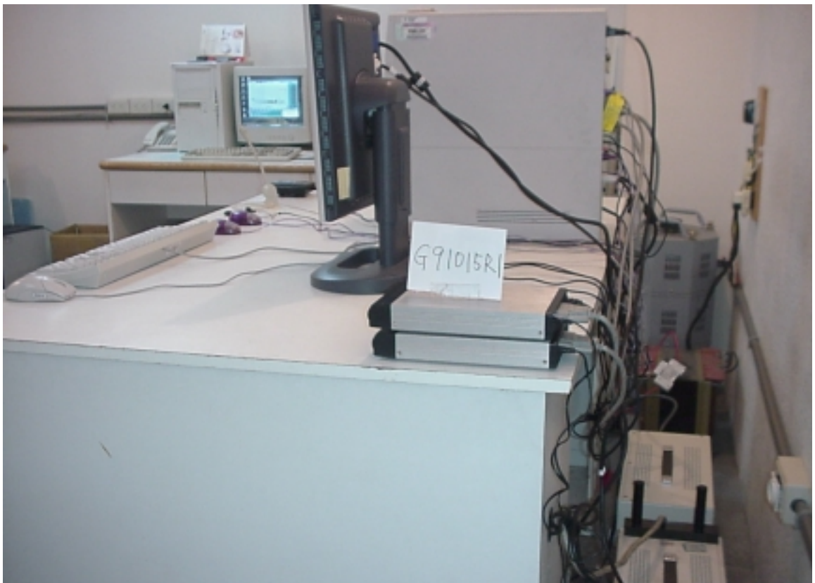
BACK VIEW OF CONDUCTED TEST