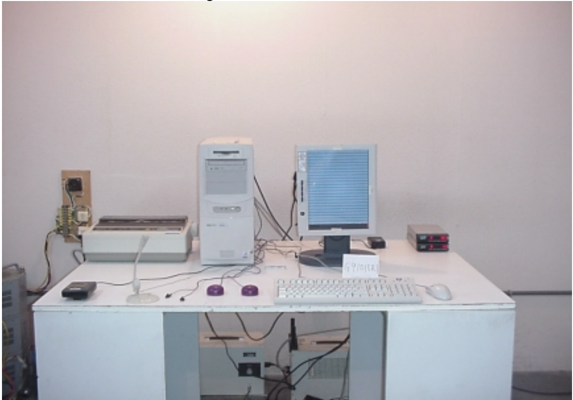
FRONT VIEW OF CONDUCTED TEST