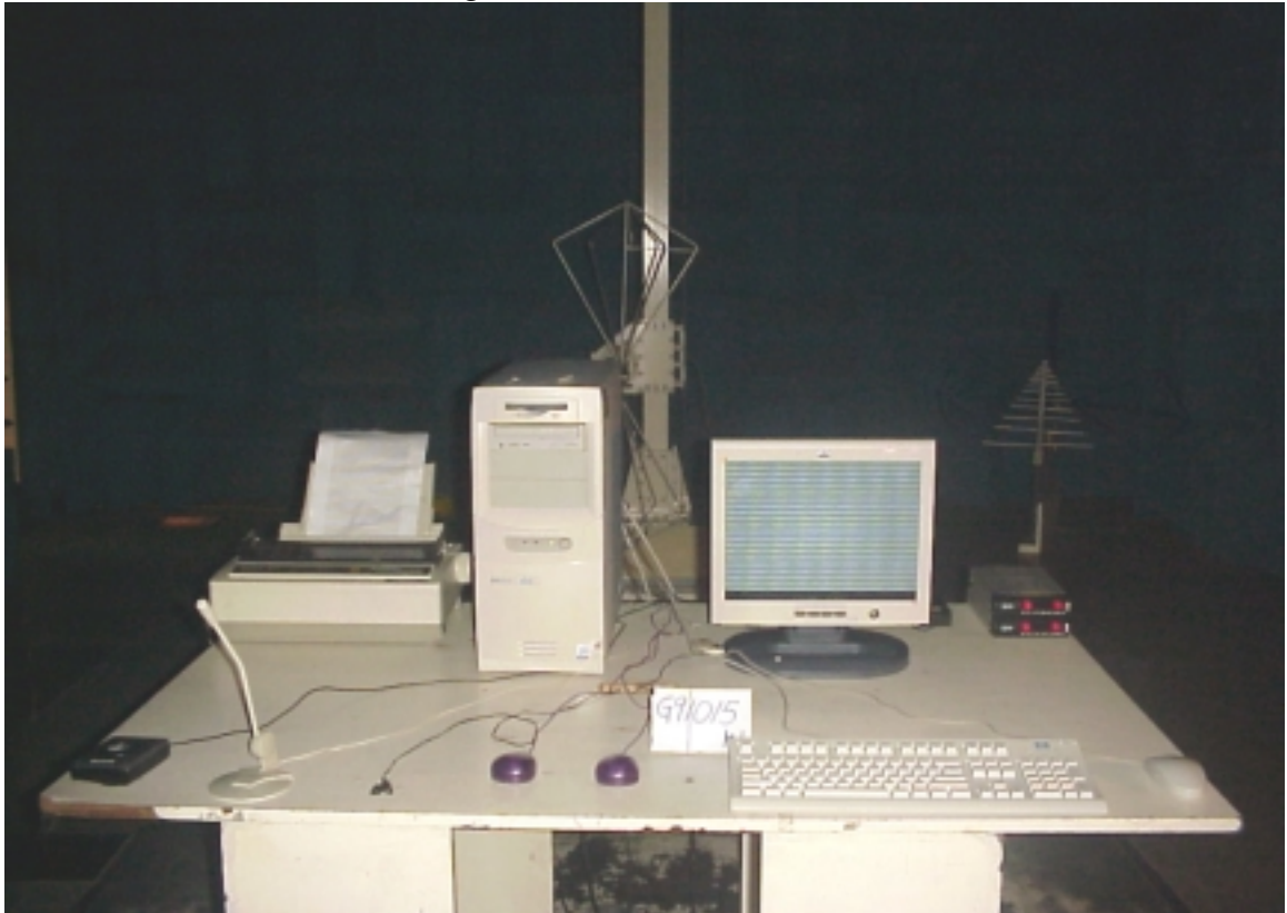
FRONT VIEW OF RADIATED TEST