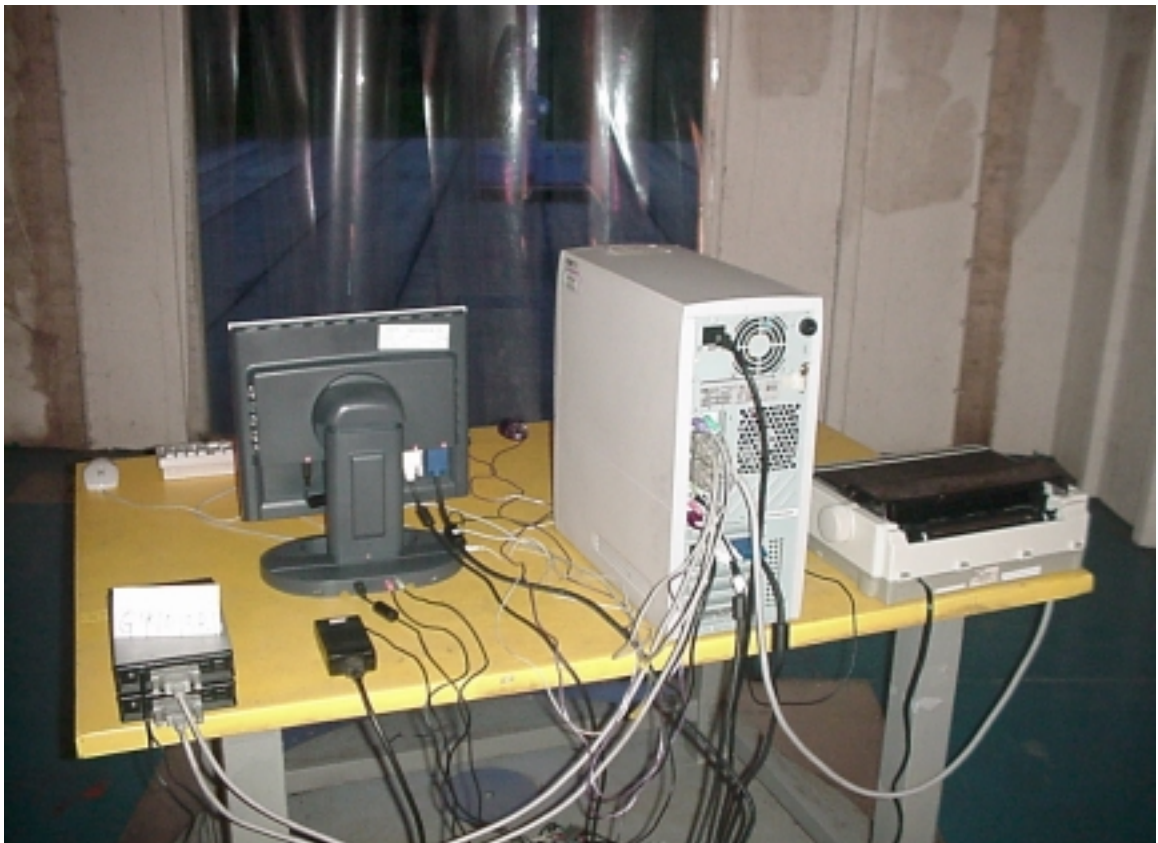
SETUP WITH MAXIMUM DETECTED EMISSION AT VERTICAL POLARIZATION