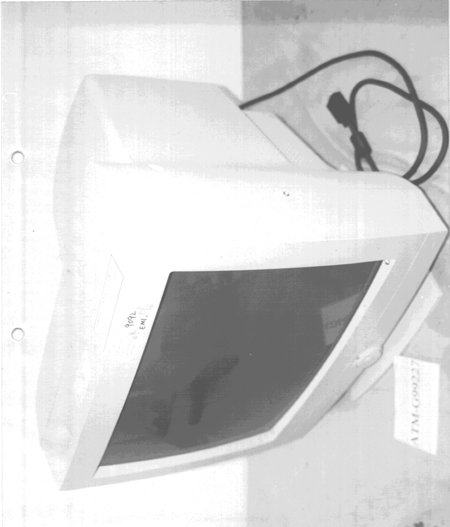
Figure 1 General Appearance (Front & Side View)