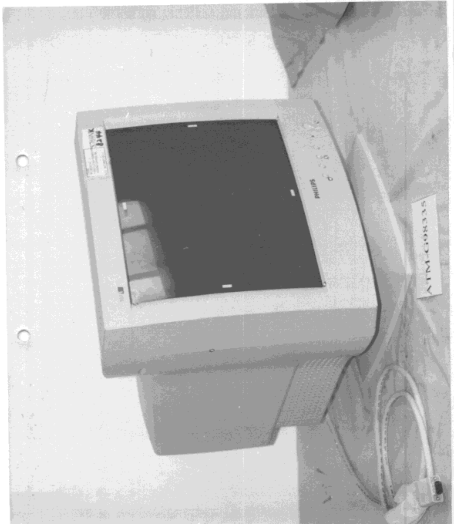
Figure 1 Front View