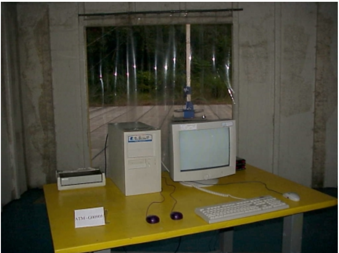
SETUP WITH MAXIMUM DETECTED EMISSION AT VERTICAL POLARIZATION