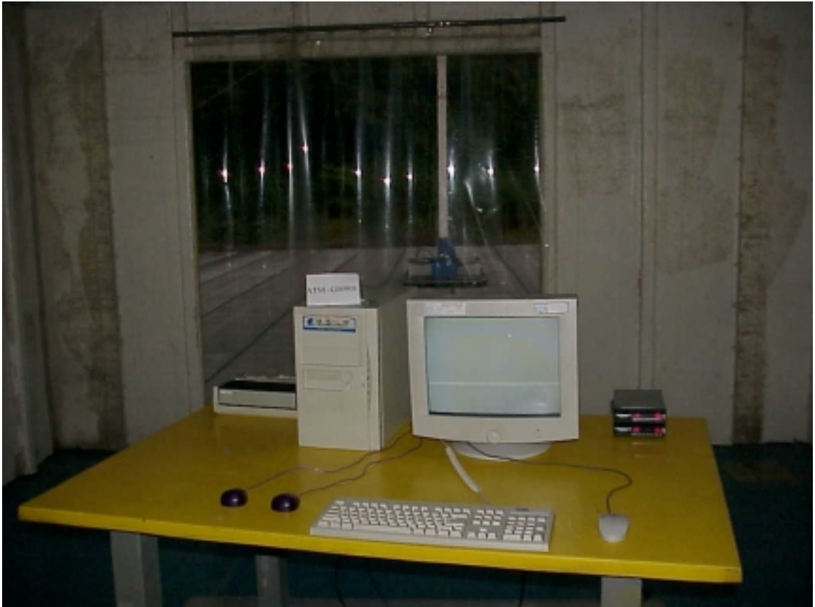
SETUP WITH MAXIMUM DETECTED EMISSION AT HORIZONTAL POLARIZATION