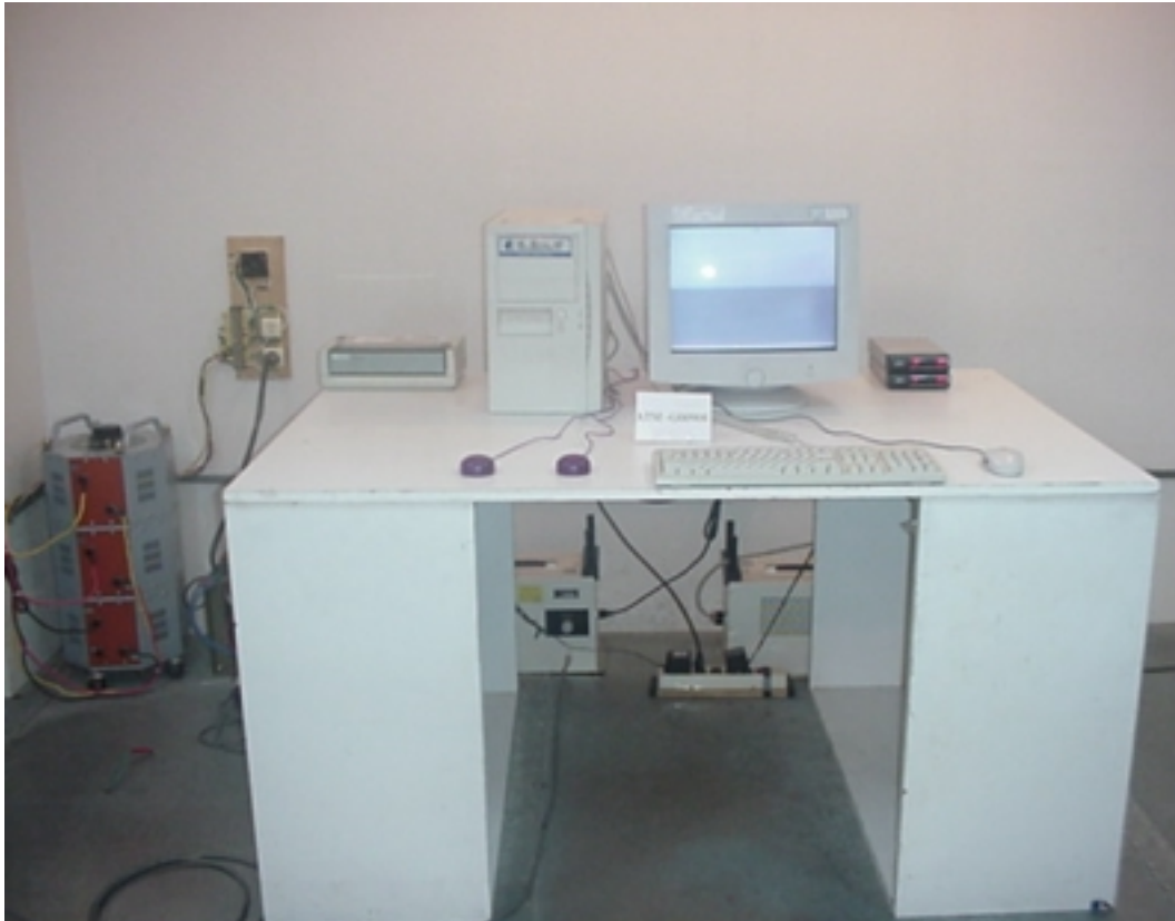
FRONT VIEW OF CONDUCTED TEST