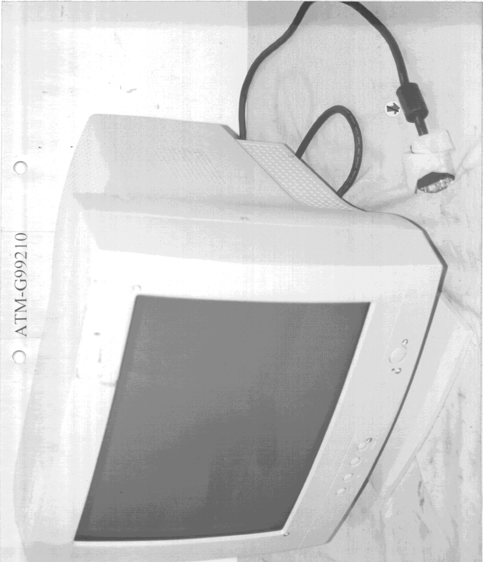
Figure 1 General Appearance (Front & Side View)