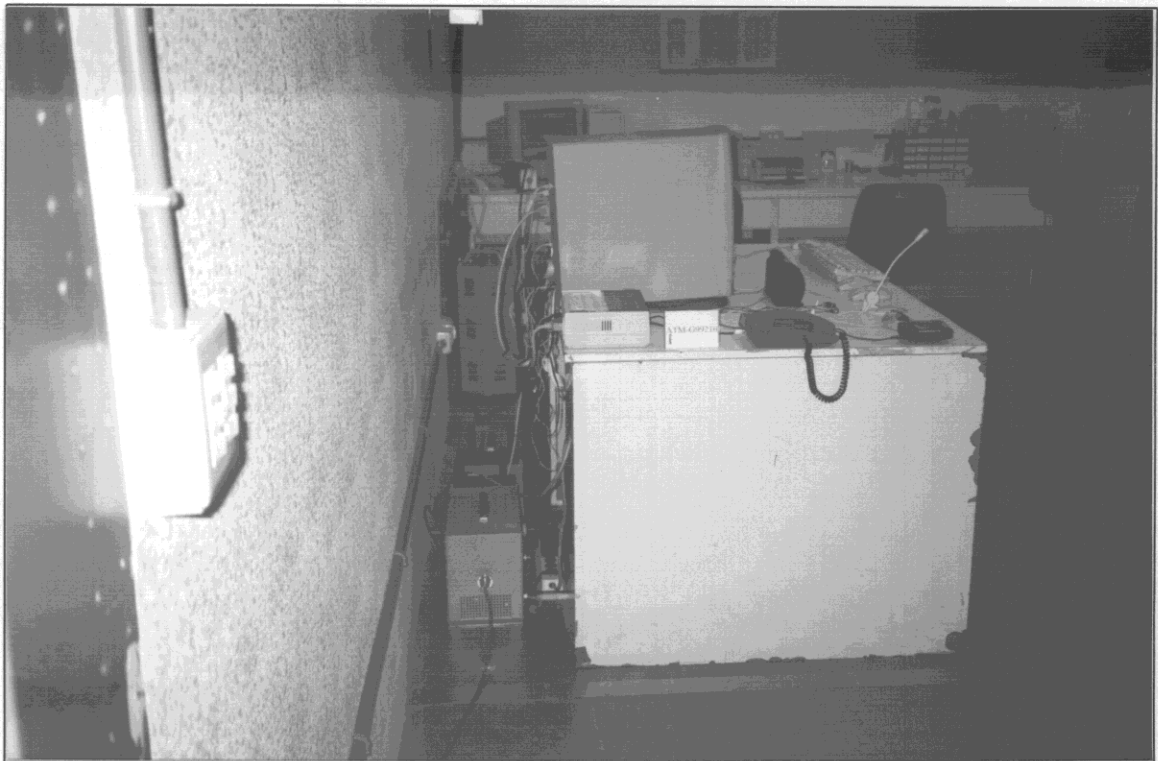
BACK VIEW OF CONDUCTED TEST