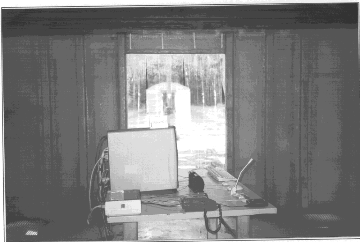
SETUP WITH MAXIMUM DETECTED EMISSION AT VERTICAL POLARIZATION