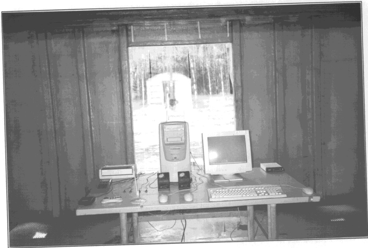
FRONT VIEW OF RADIATED TEST