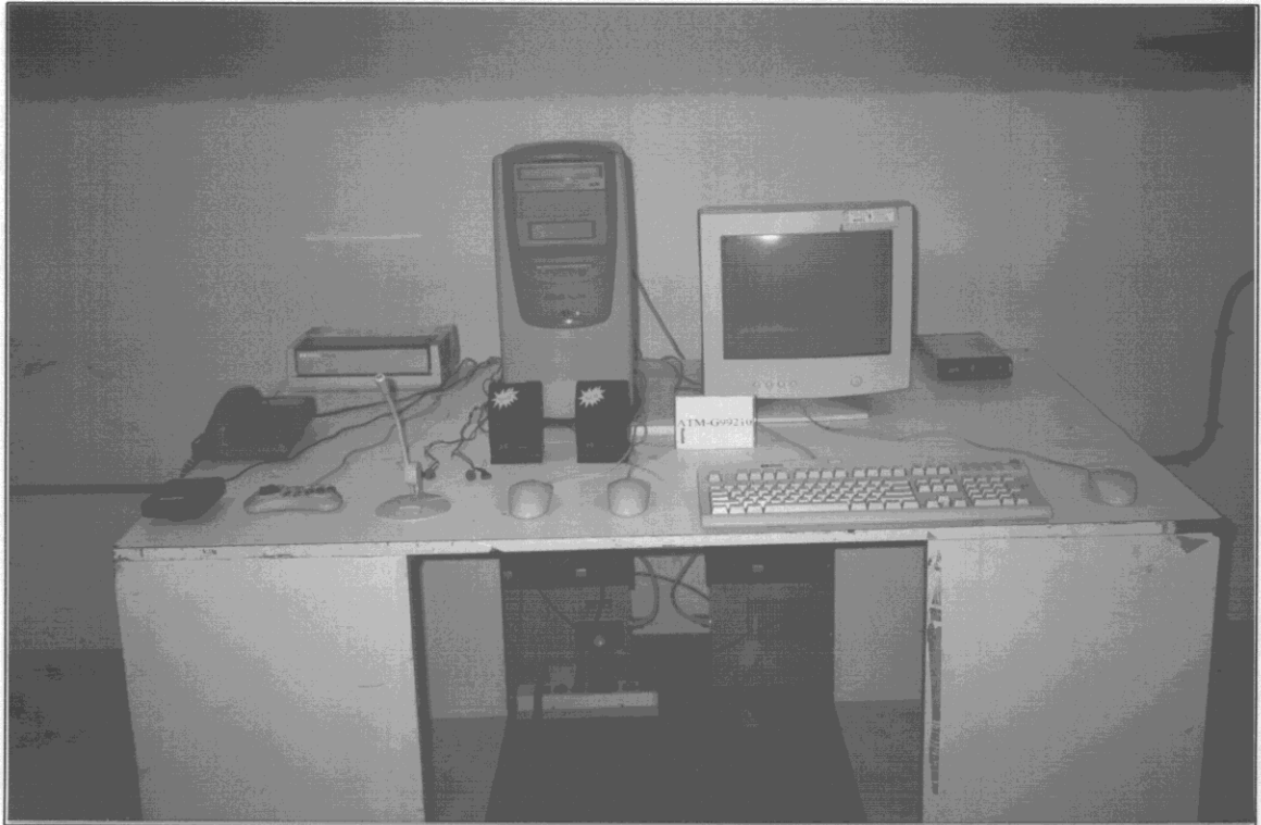
FRONT VIEW OF CONDUCTED TEST