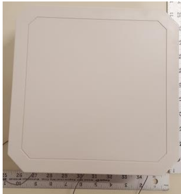
Figure B1. Top View of DUT