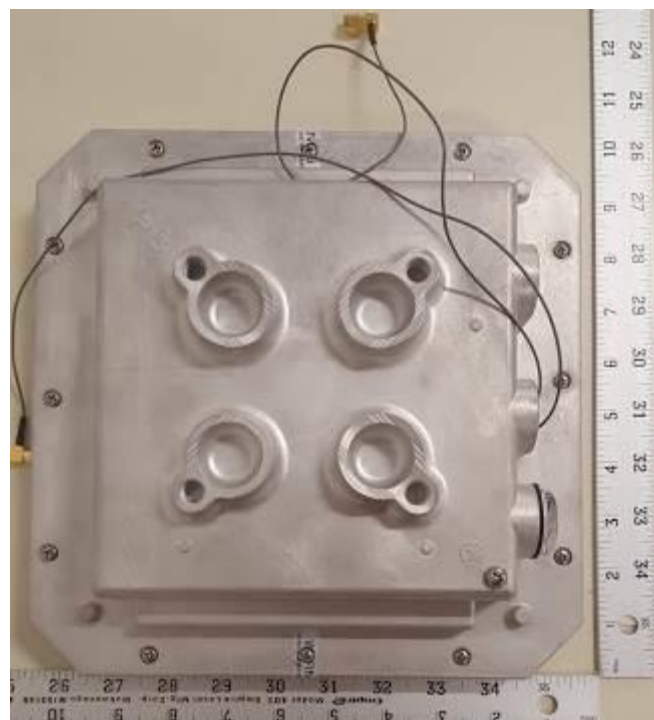
Figure B2. DUT rear view