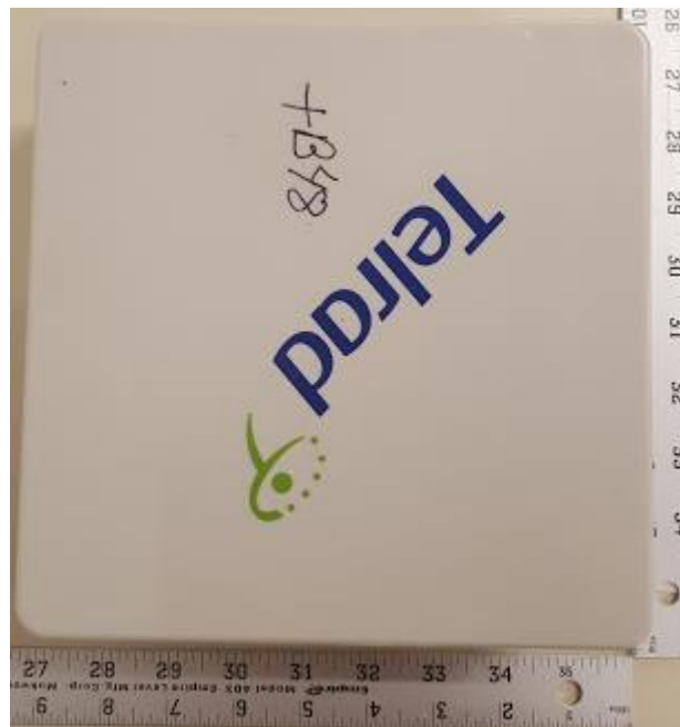
Figure B1. Top View of DUT