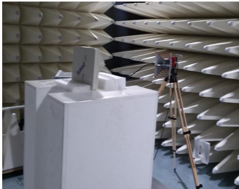
Figure B4: High Range 1-18GHz Radiated Emission test setup Using horn antenna