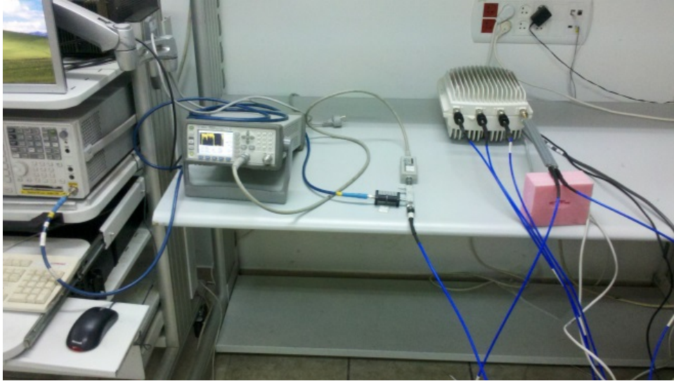
Photograph No.1 Peak output power measurement setup