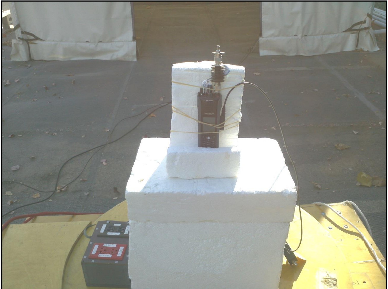
Photograph 1: Radiated Emissions (Front View)