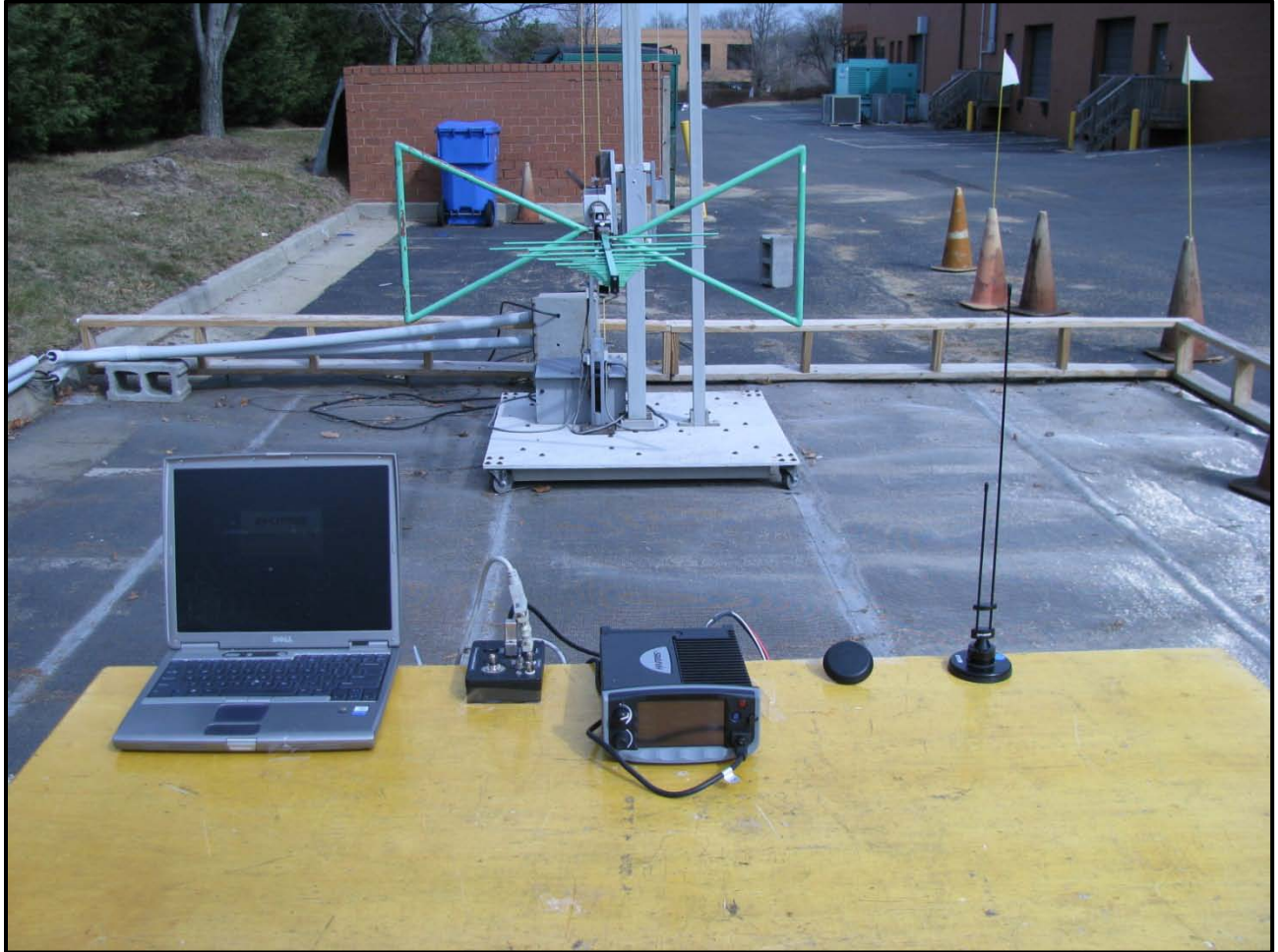
Photograph 1: Radiated Testing – Front View