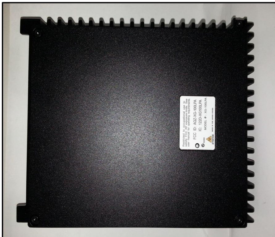
Photograph 2: ID Label Location on Bottom