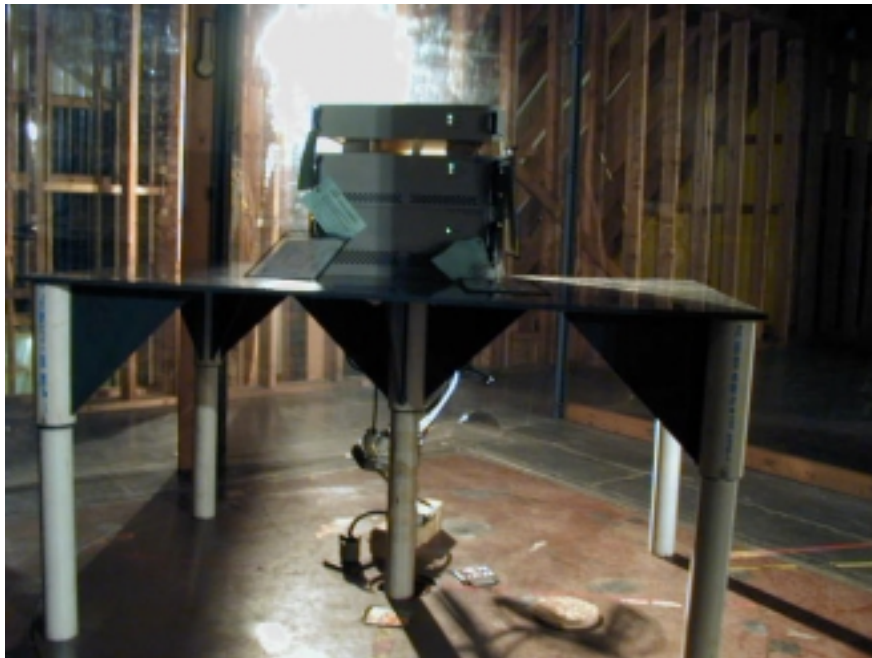
LAAS System Radiated Emissions