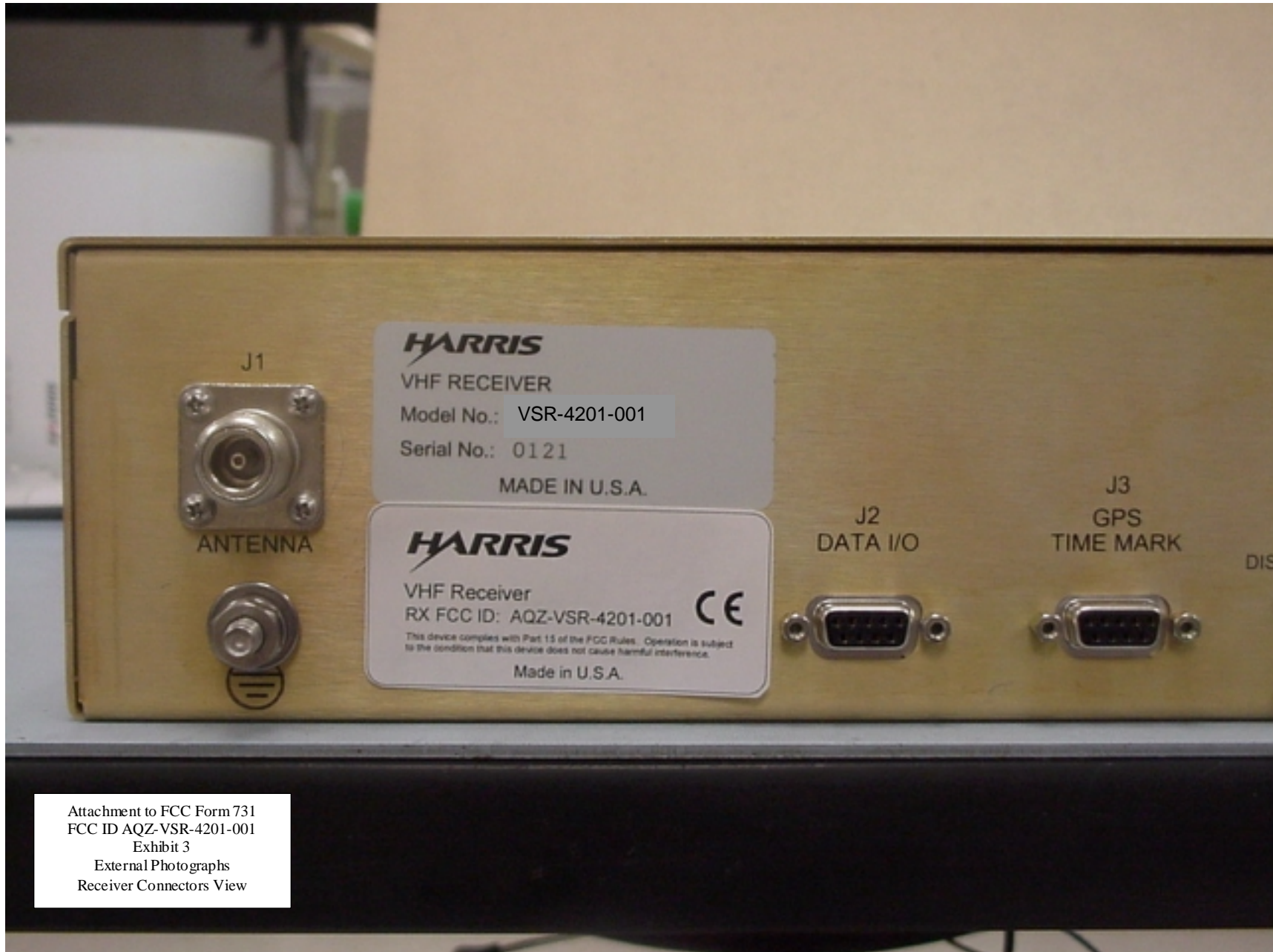
Attachment to FCC Form 731 FCC ID AQZ-VSR-4201-001 Exhibit 3 External Photographs Receiver Connectors View