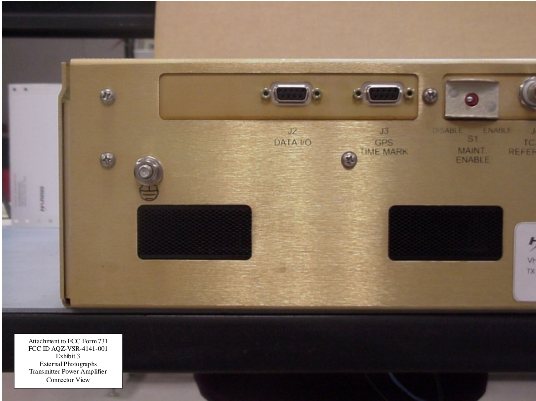
Attachment to FCC Form 731 FCC ID AQZ-VSR-4141-001 Exhibit 3 External Photographs Transmitter Power Amplifier Connector View