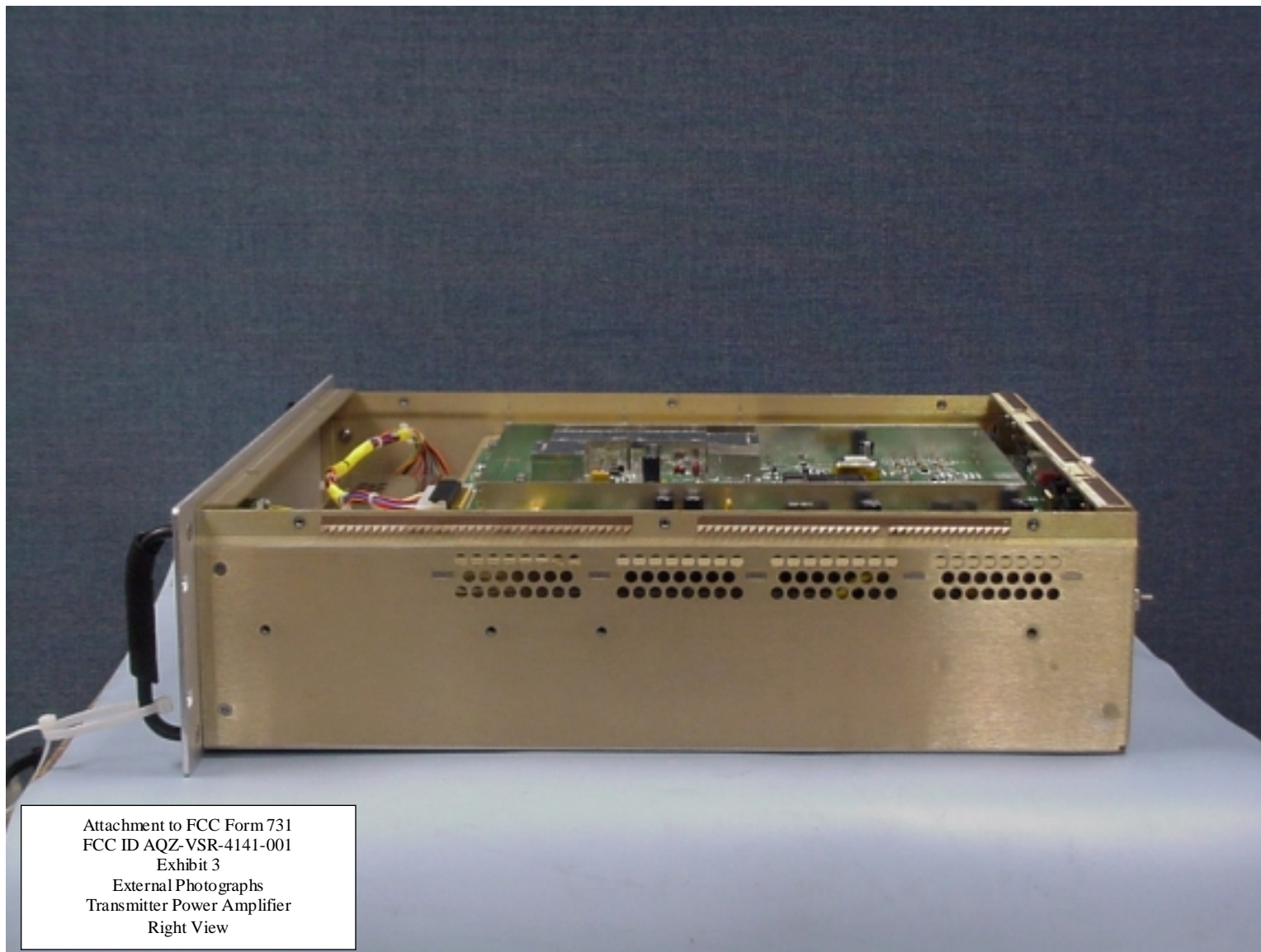
Attachment to FCC Form 731 FCC ID AQZ-VSR-4141-001 Exhibit 3 External Photographs Transmitter Power Amplifier Right View