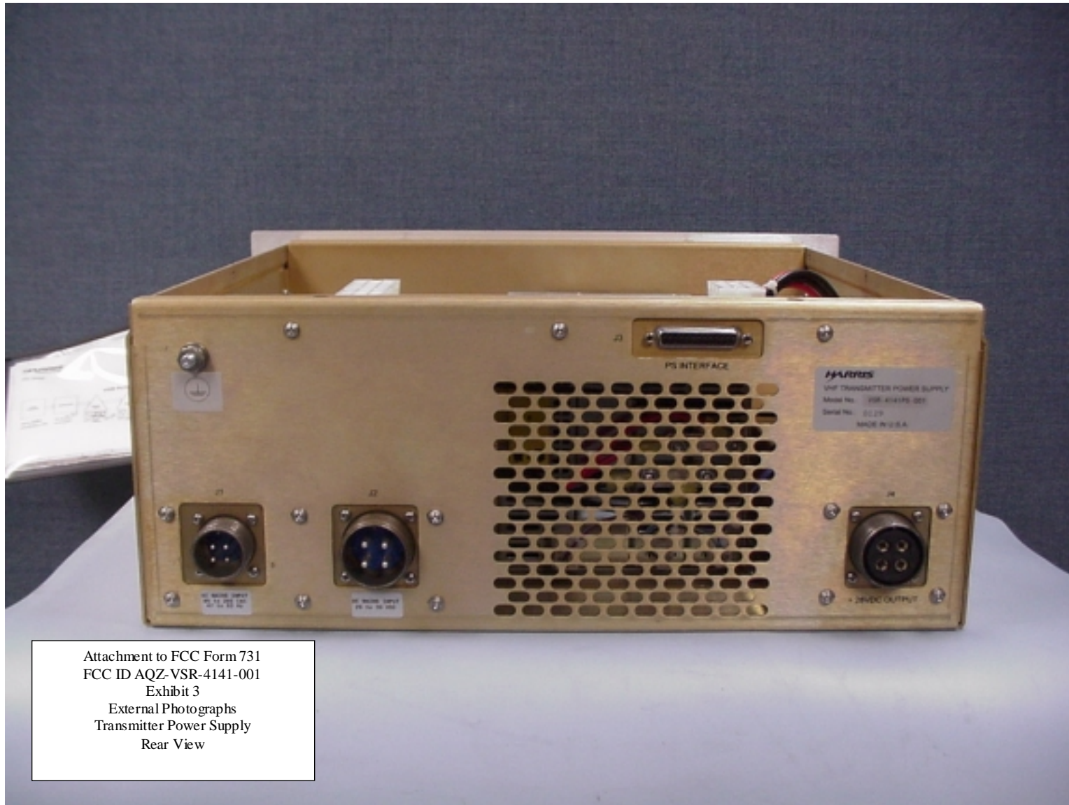
Attachment to FCC Form 731 FCC ID AQZ-VSR-4141-001 Exhibit 3 External Photographs Transmitter Power Supply Rear View