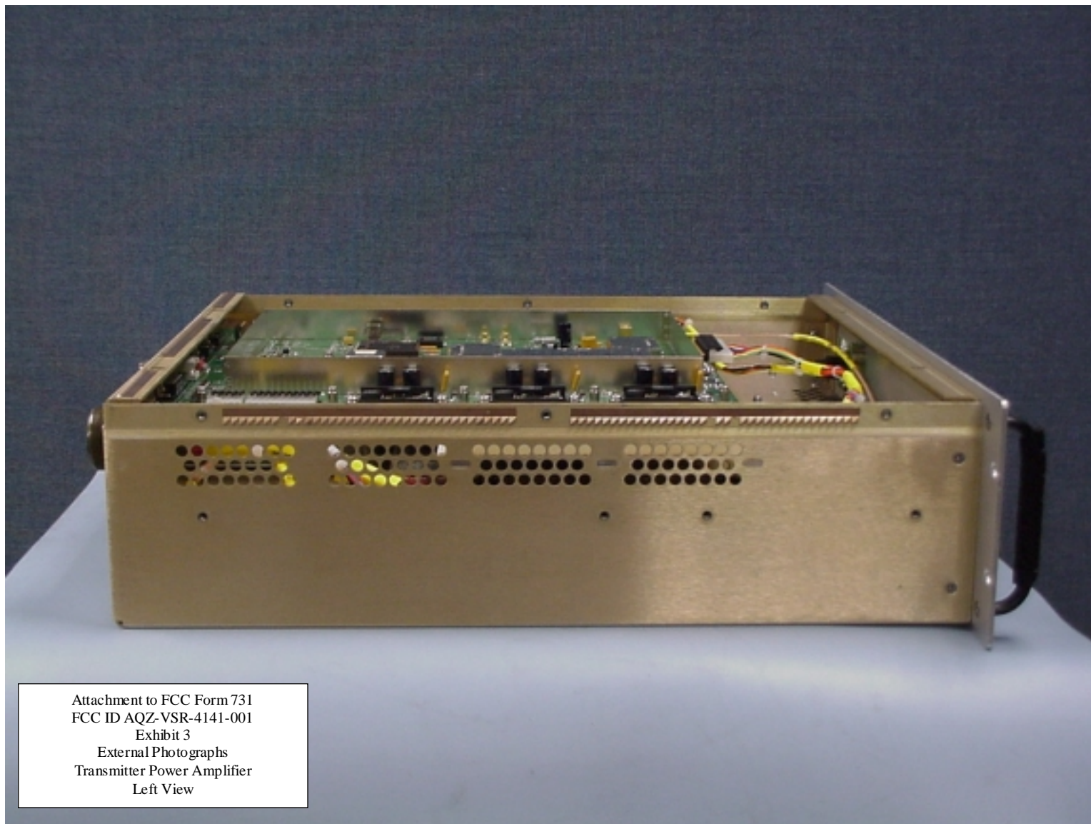
Attachment to FCC Form 731 FCC ID AQZ-VSR-4141-001 Exhibit 3 External Photographs Transmitter Power Amplifier Left View