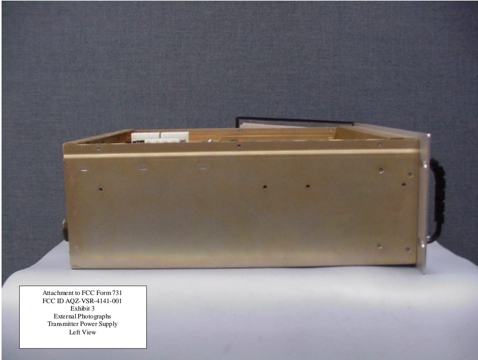
Attachment to FCC Form 731 FCC ID AQZ-VSR-4141-001 Exhibit 3 External Photographs Transmitter Power Supply Left View