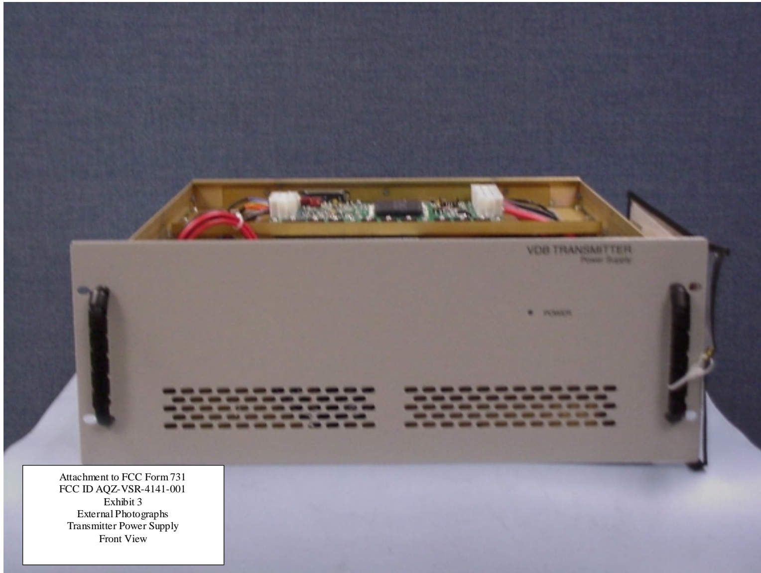
Attachment to FCC Form 731 FCC ID AQZ-VSR-4141-001 Exhibit 3 External Photographs Transmitter Power Supply Front View