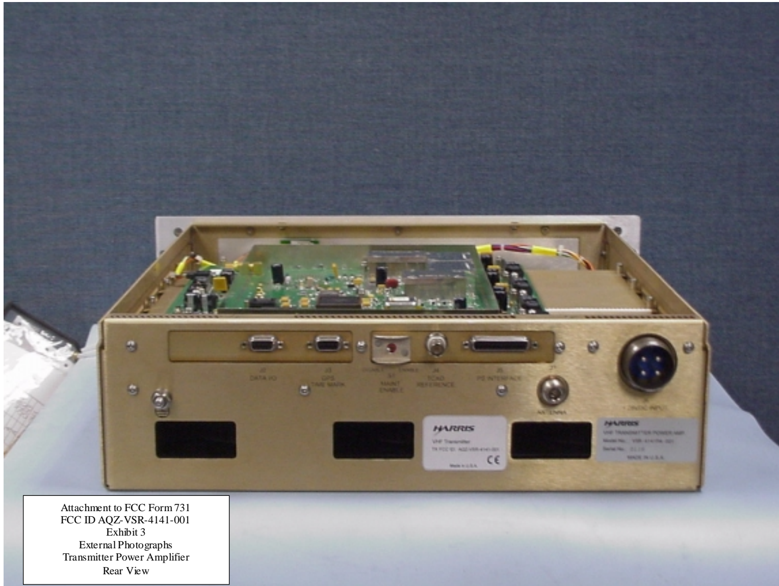
Attachment to FCC Form 731 FCC ID A22-VSR-4141-001 Exhibit 3 External Photographs Transmitter Power Amplifier Rear View