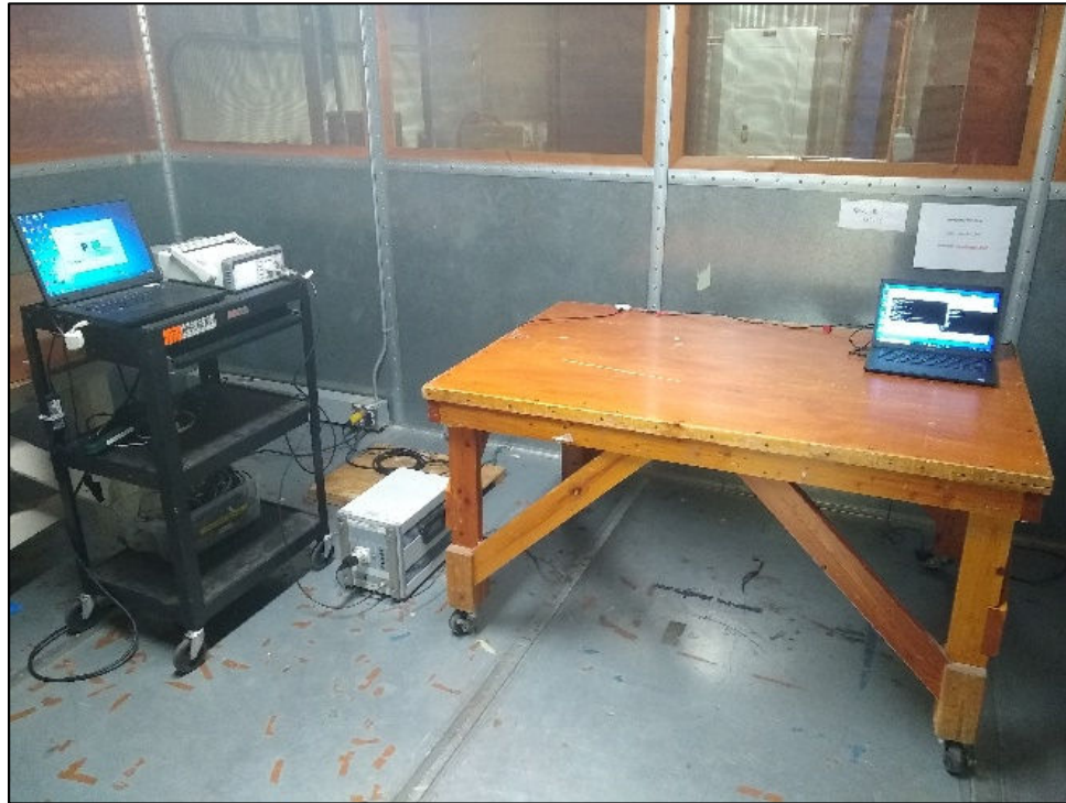
Photograph 3. Conducted Emissions Limits, Test Setup