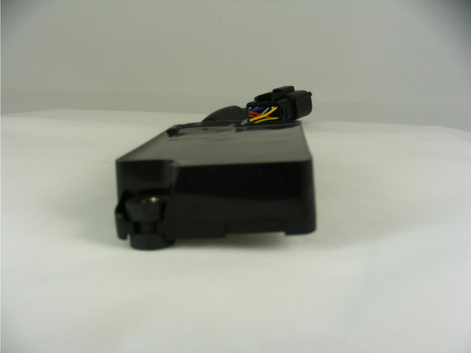
Figure 5: Topside