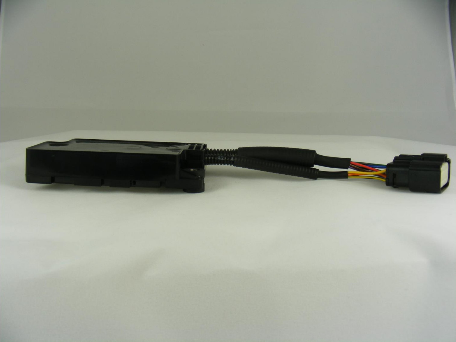
Figure 3: KCU2 Right-side