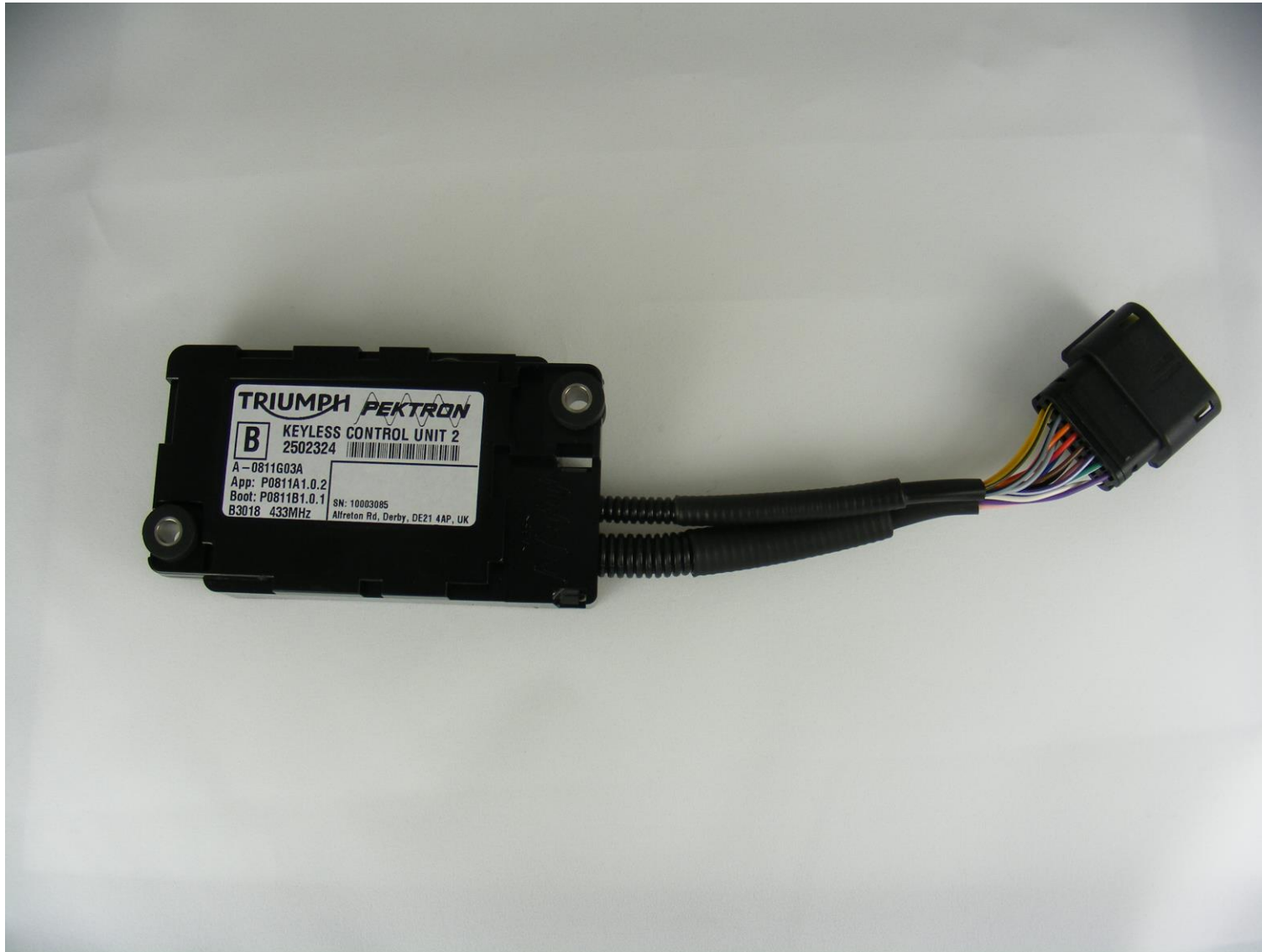
Figure 2: KCU2 Front-side