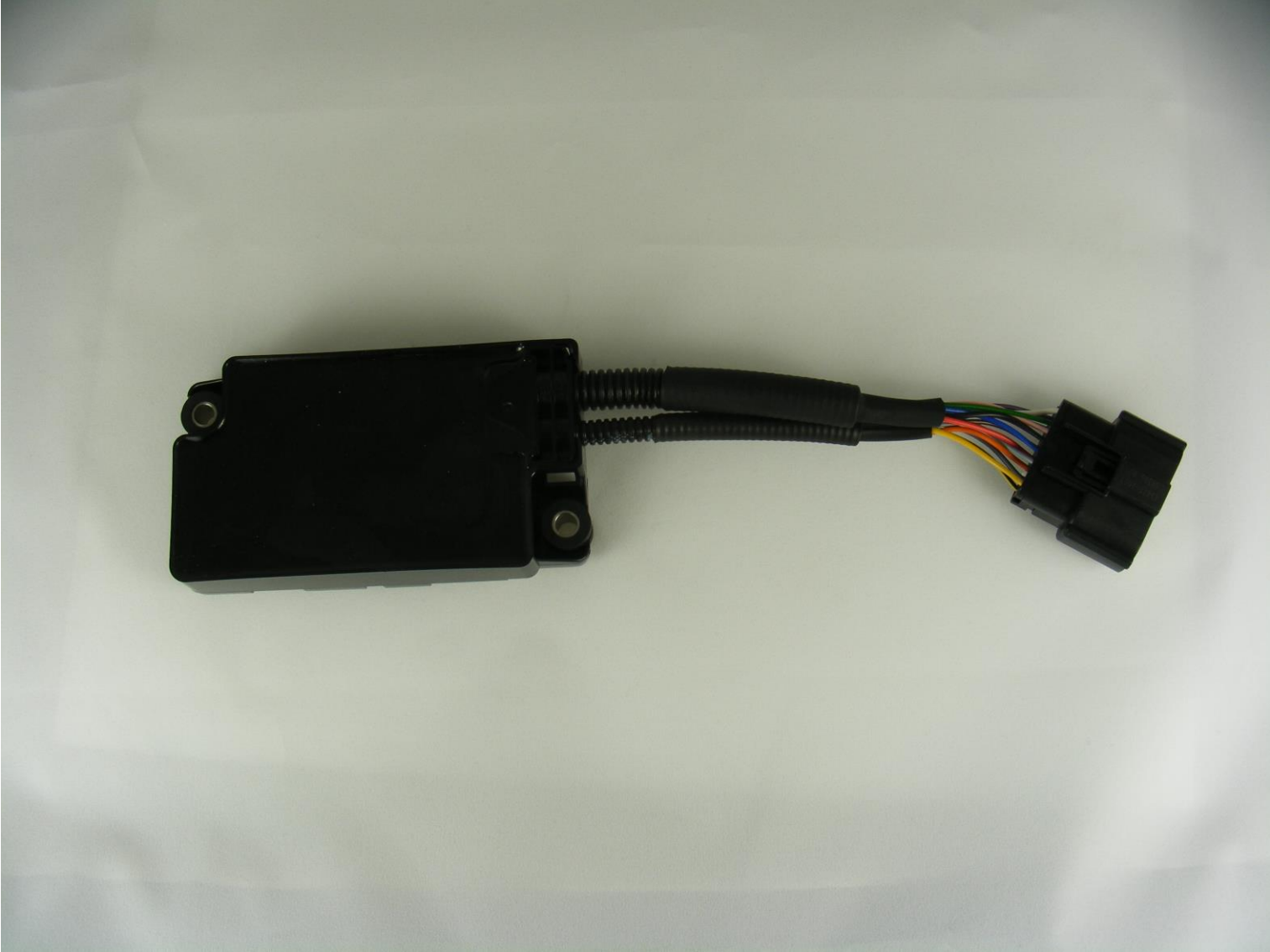
Figure 6: KCU2 Backside