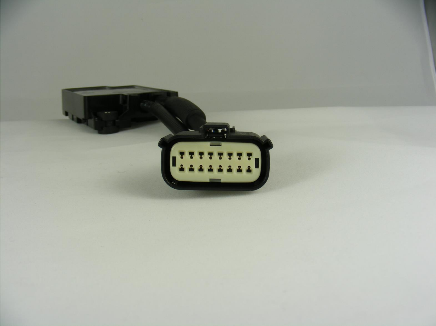
Figure 1: KCU2 Underside / Connector