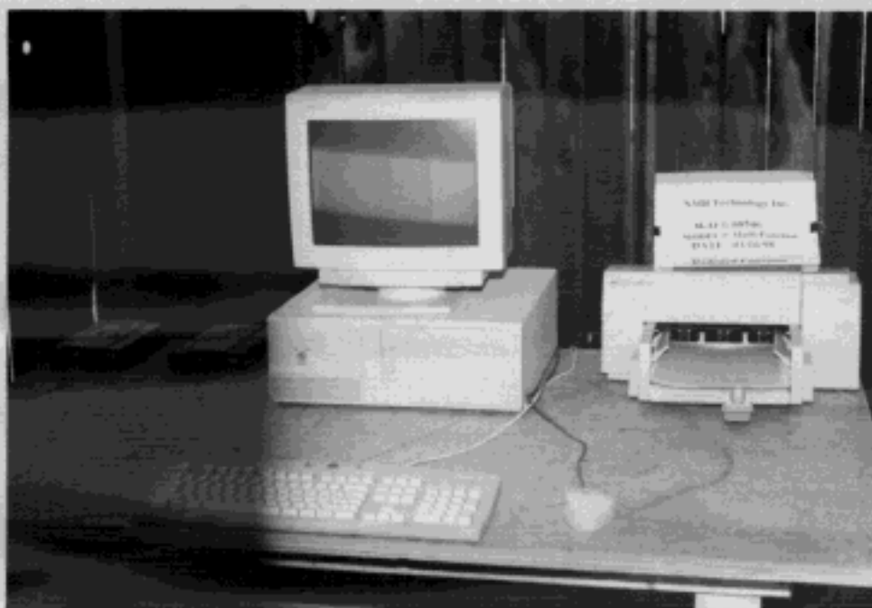
Radiated Emissions - Front View

Client: NMB Technologies Inc. Equipment: Keyboard Model Number: RT28XXXXX