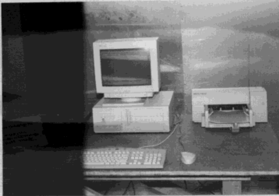
Conducted Emissions - Front View

Applicant: NMB Technologies Inc. Equipment: Keyboard Model Number: RT28XXXXX