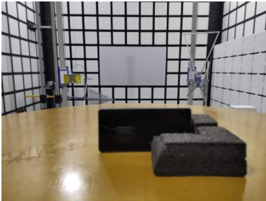
Antenna Mode Side-standing