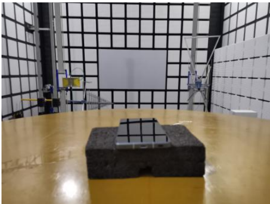
Antenna Mode Lay down