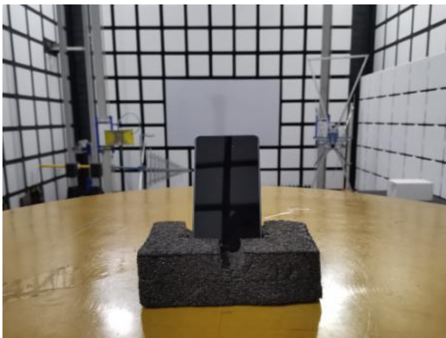
Antenna Mode Stand