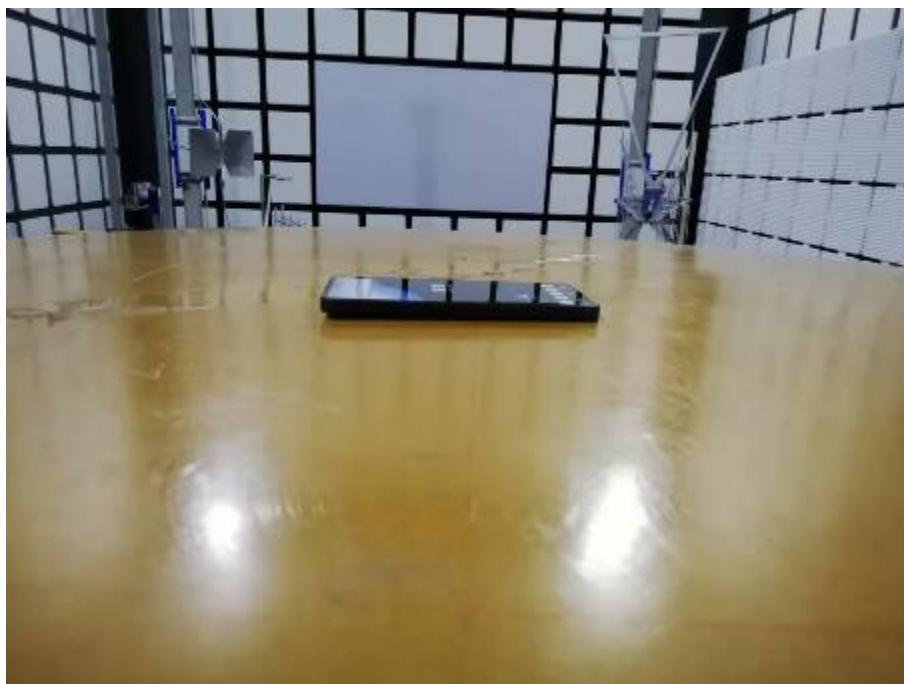
Antenna Mode Lay down