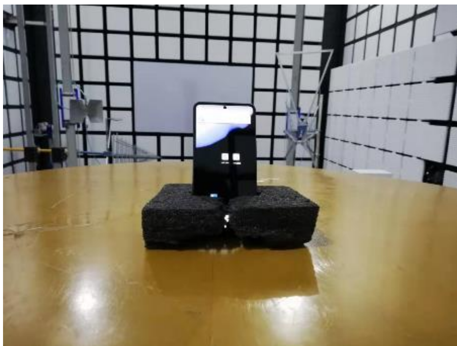
Antenna Mode Stand