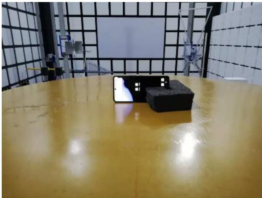
Antenna Mode Side-standing