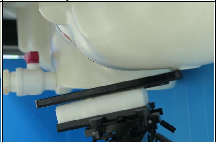
Left Tilted of EUT Tested