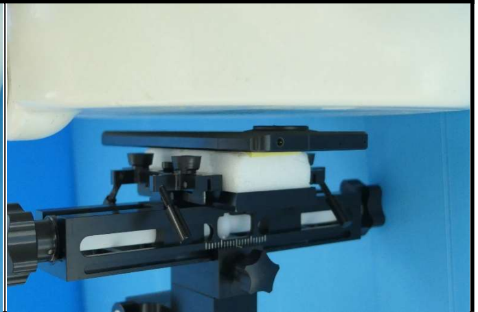
Rear Face of EUT Tested at 10 mm