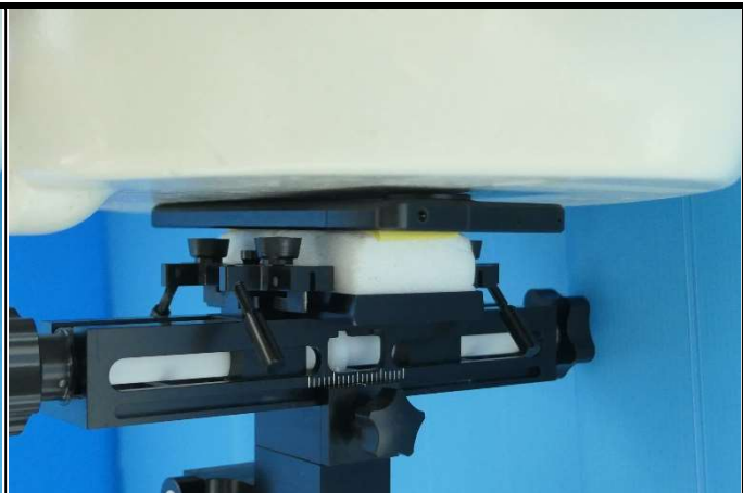
Rear Face of EUT Tested at 0 mm