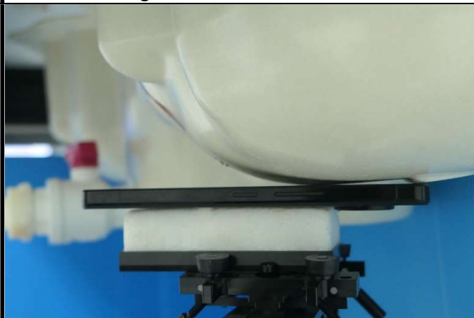
Left Cheek of EUT Tested