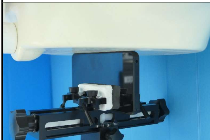
Left Side of EUT Tested at 0 mm