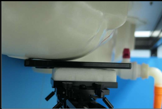
Right Cheek of EUT Tested