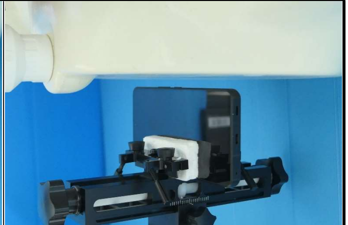
Right Side of EUT Tested at 10 mm