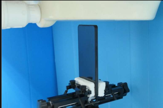
Top Side of EUT Tested at 10 mm