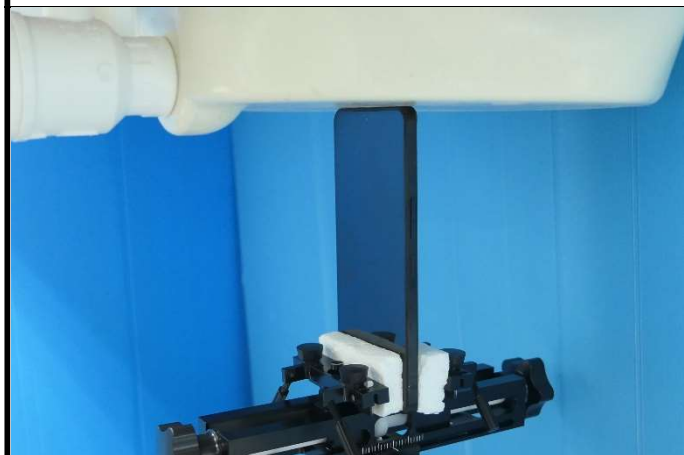
Top Side of EUT Tested at 0 mm