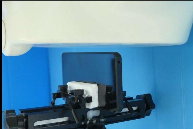
Left Side of EUT Tested at 10 mm