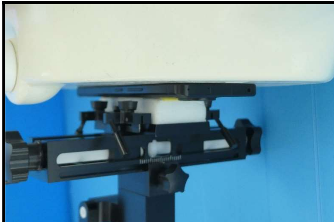
Front Face of EUT Tested at 0 mm