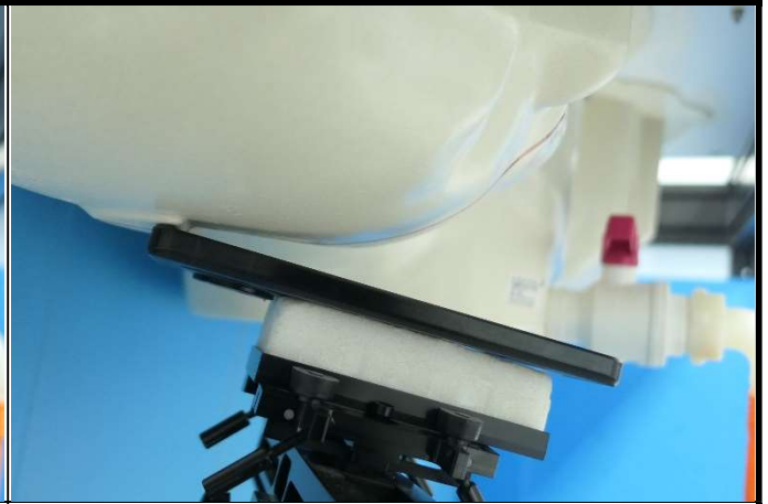
Right Tilted of EUT Tested