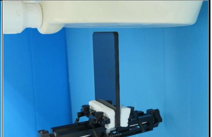
Bottom Side of EUT Tested at 10 mm