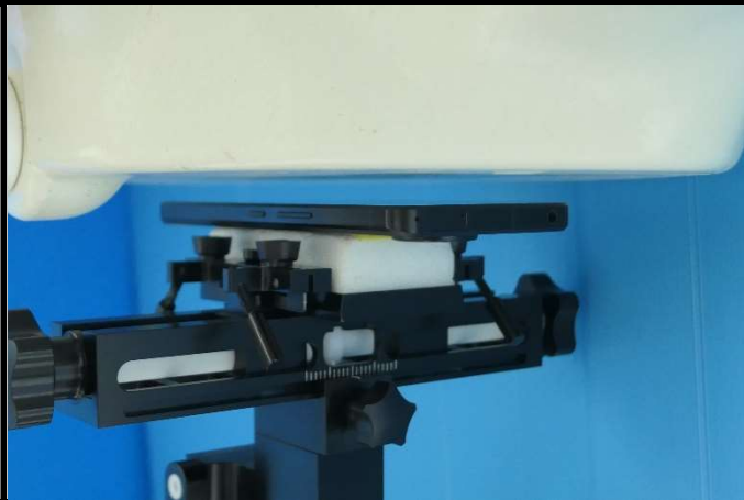
Front Face of EUT Tested at 10 mm