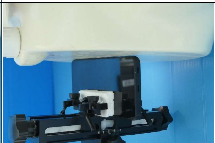
Right Side of EUT Tested at 0 mm