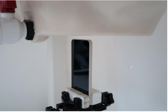
Bottom Side at 10 mm

TEL: 886-3-327-3456 Page: D2 of D3 FAX: 886-3-328-4978 Issued Date: Oct. 29, 2021