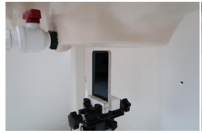
Top Side at 10 mm