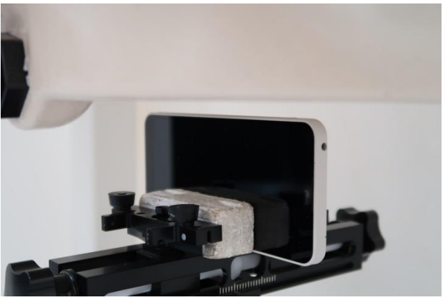
Left Side at 10 mm