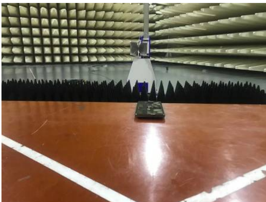
Radiated Emissions Test Setup (above 1GHz)