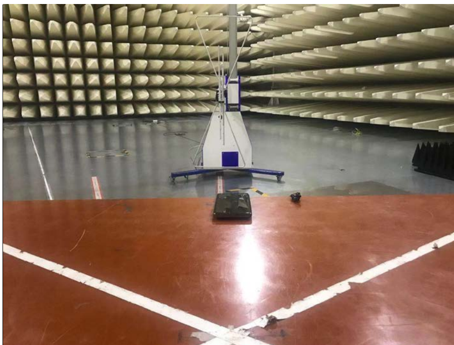
Radiated Emissions Test Setup (30-1000MHz)