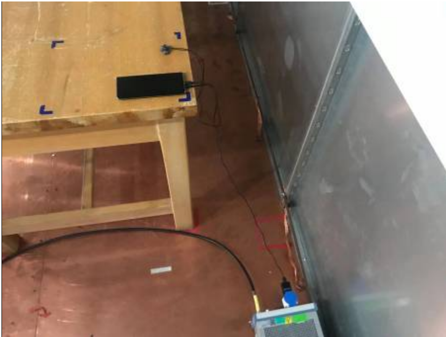
Conducted Emissions Test Setup