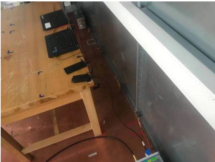
Conducted Emissions Test Setup (with laptop)