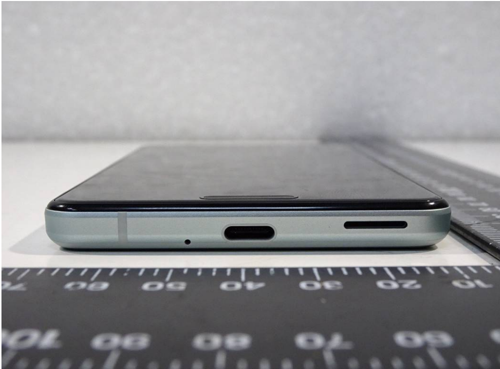
Side View of EUT – 2