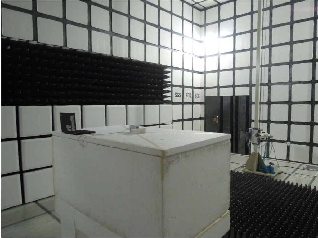
Radiated Emission Set up Photos (Front View)