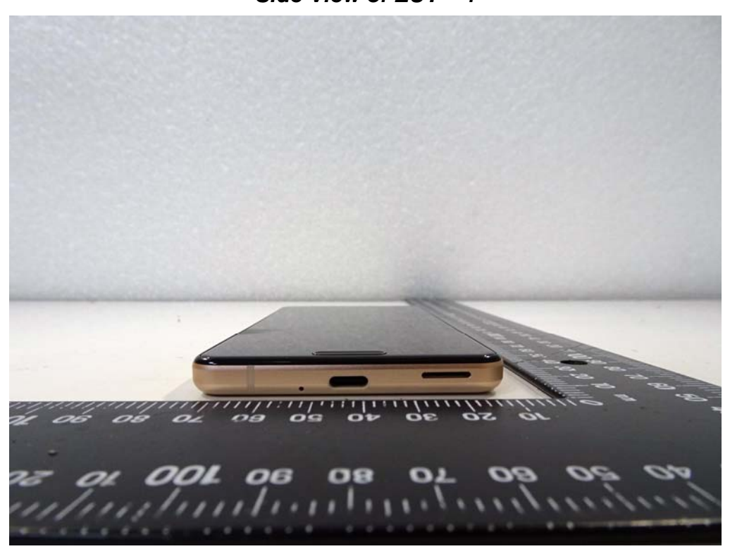
Side View of EUT - 2