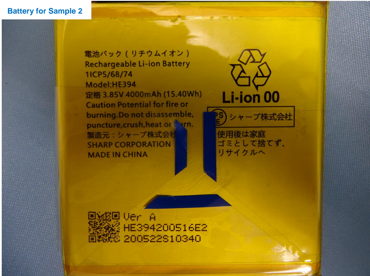
Battery for Sample 2