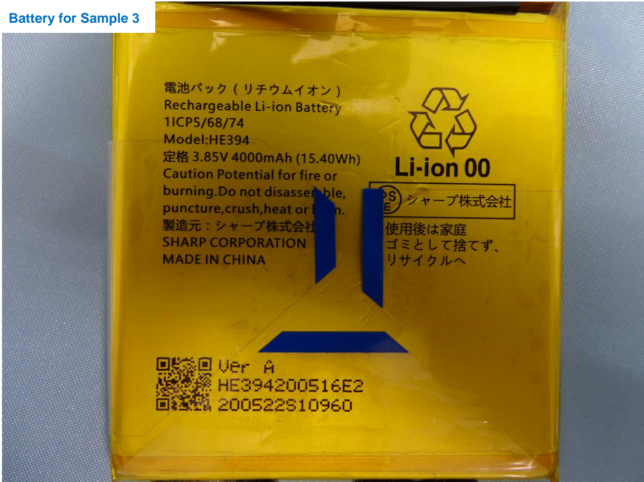
Battery for Sample 3