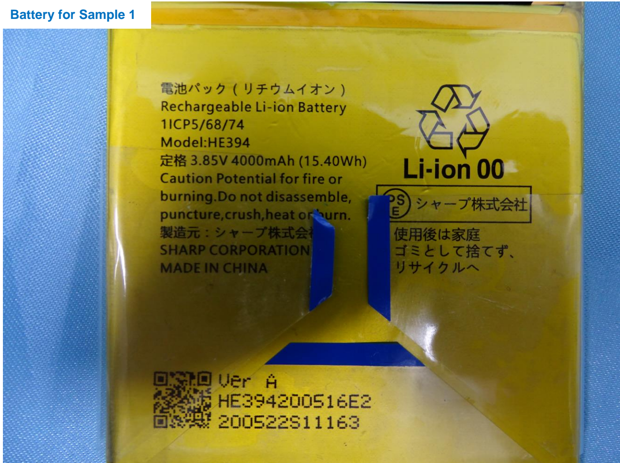
Battery for Sample 1