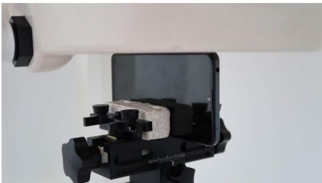
Left Side, Test Separation 0 mm