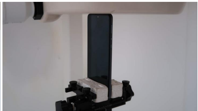
Top Side, Test Separation 0 mm