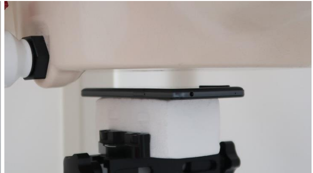
Back, Test Separation 15 mm