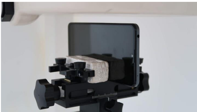
Left Side, Test Separation 10 mm