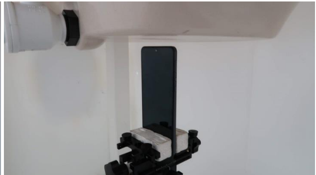
Top Side, Test Separation 10 mm