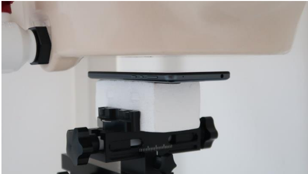
Front, Test Separation 15 mm