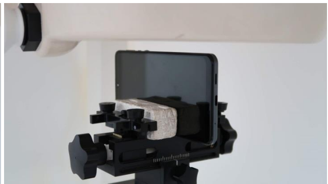
Right Side, Test Separation 10 mm