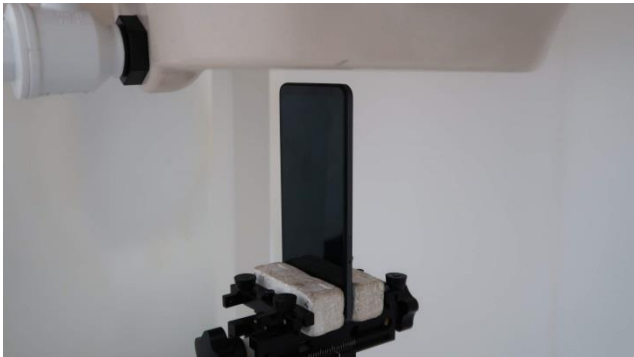
Bottom Side, Test Separation 10 mm