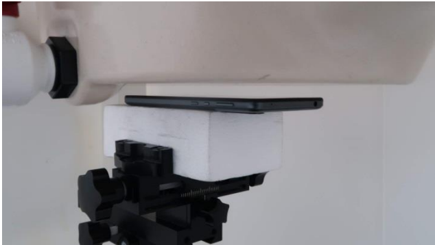
Front, Test Separation 10 mm