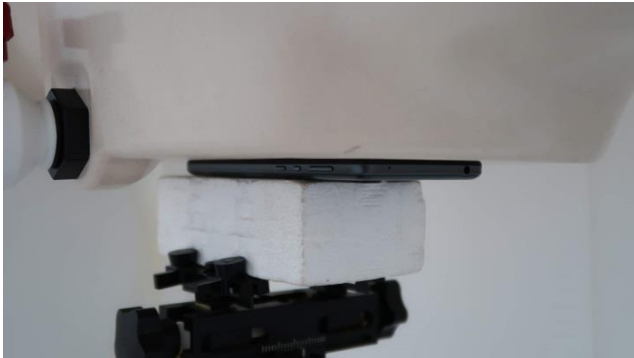
Front, Test Separation 0 mm