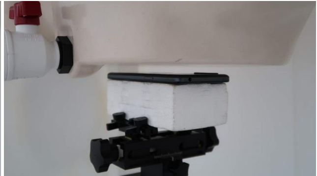
Back, Test Separation 10 mm