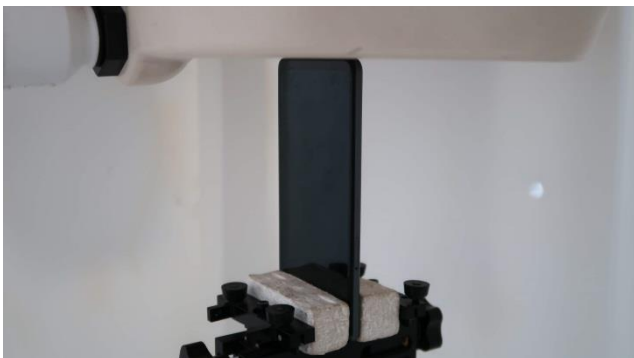
Bottom Side, Test Separation 0 mm