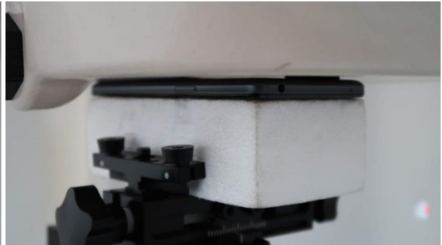
Back, Test Separation 0 mm